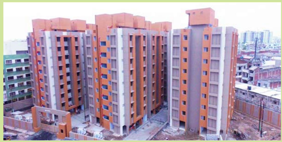
Houses constructed under AHP, Surat, Guiarat

A beneficiary will be eligible for availing only a single benefit under any of the existing options i.e. Slum Redevelopment with Private Partner, Credit Linked Subsidy, Direct Subsidy to Individual Beneficiary and Affordable Housing in Partnership. It will be the responsibility of States/UTs Government to ensure that the beneficiary is not given benefit under more than one component of the Mission.