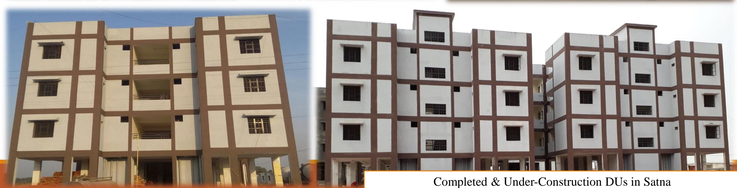
Completed & Under-Construction DUs in Satna