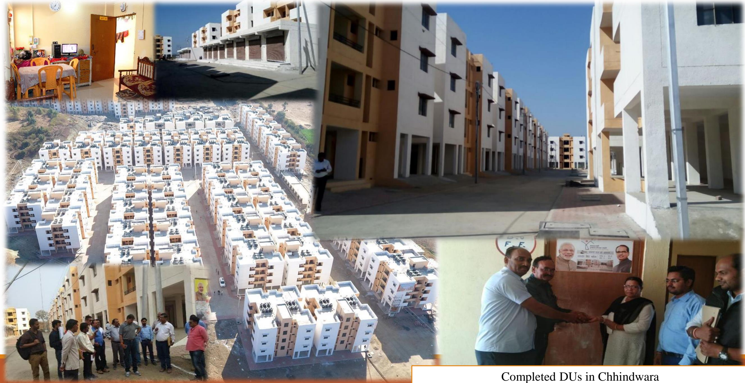
Completed DUs in Chhindwara