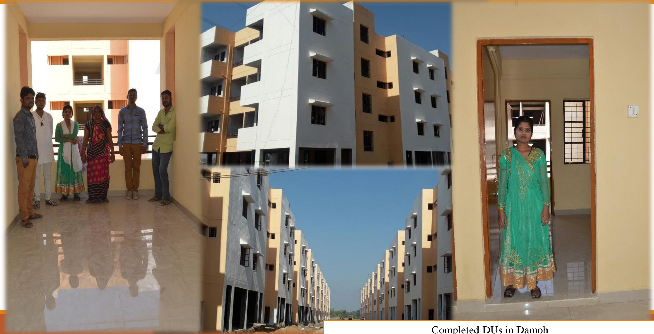
Completed DUs in Damoh