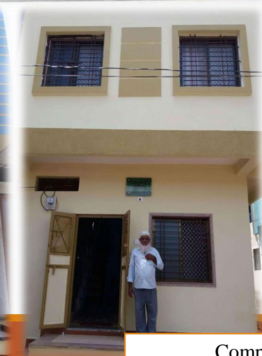
Completed and Under-Construction DUs in Alirajpur