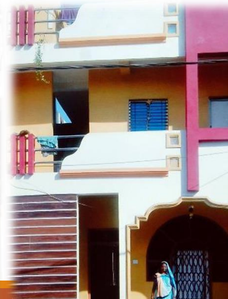
Completed BLC DUs in Sendhwa