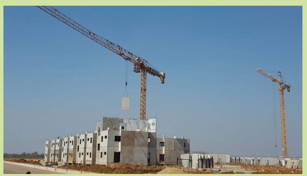
AHP under Construction Houses using pre-cast technology at naya Raipur, Chattisgarh