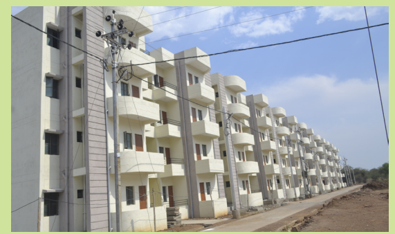
AHP under PMAY (U) in Pendri, Rajnandgaon, Chattisgarh