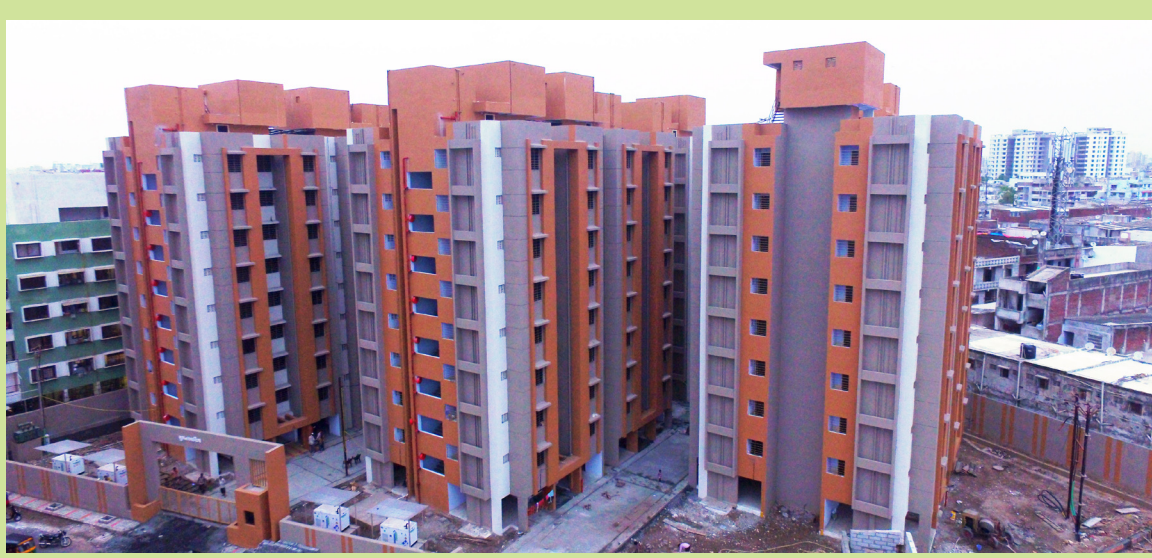
Houses constructed under AHP. Surat. Guiarat

A beneficiary will be eligible for availing only a single benefit under any of the existing options i.e. Slum Redevelopment with Private Partner, Credit Linked Subsidy, Direct Subsidy to Individual Beneficiary and Affordable Housing in Partnership. It will be the responsibility of States/UTs Government to ensure that the beneficiary is not given benefit under more than one component of the Mission.