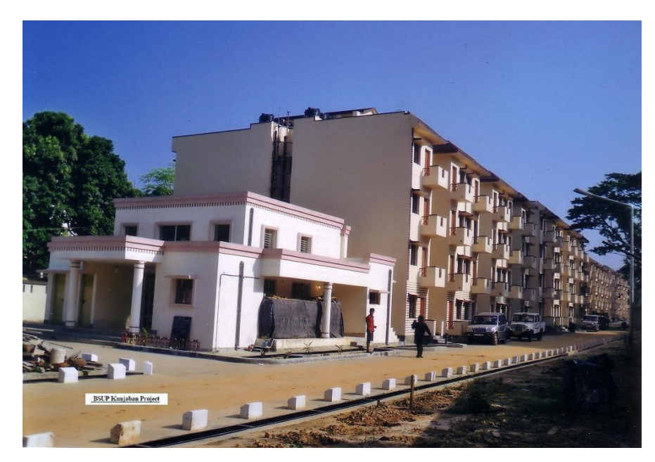
Vivekananda Awasan under BSUP