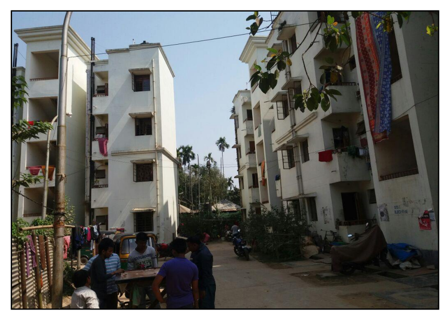
Joynagar Awasan under 10 % Lumpsum