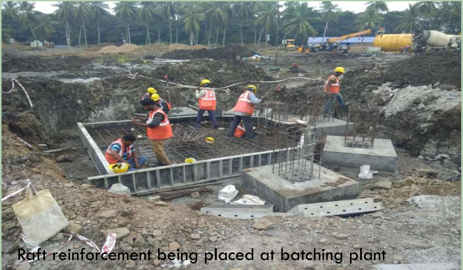
Raft reinforcement being placed at batching plant