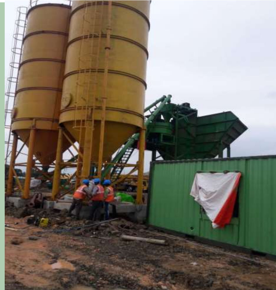
Batching plant at T. Gudem