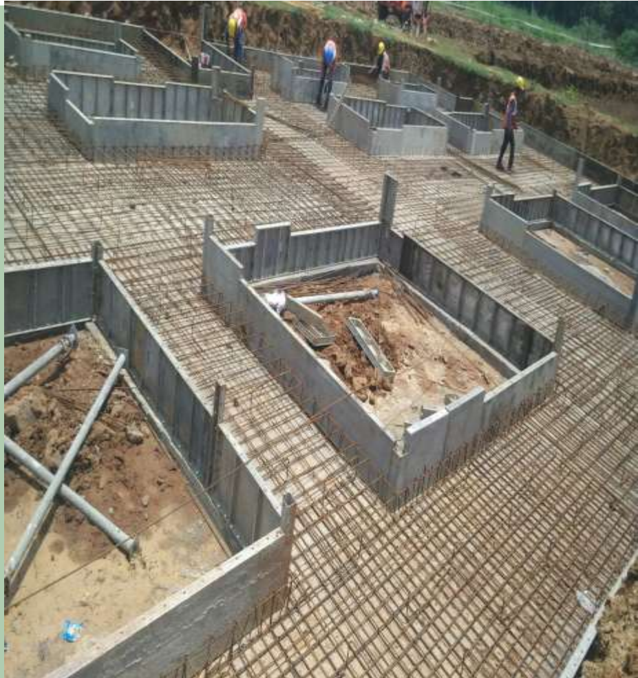
Raft rebar tying at Tadepalligudem