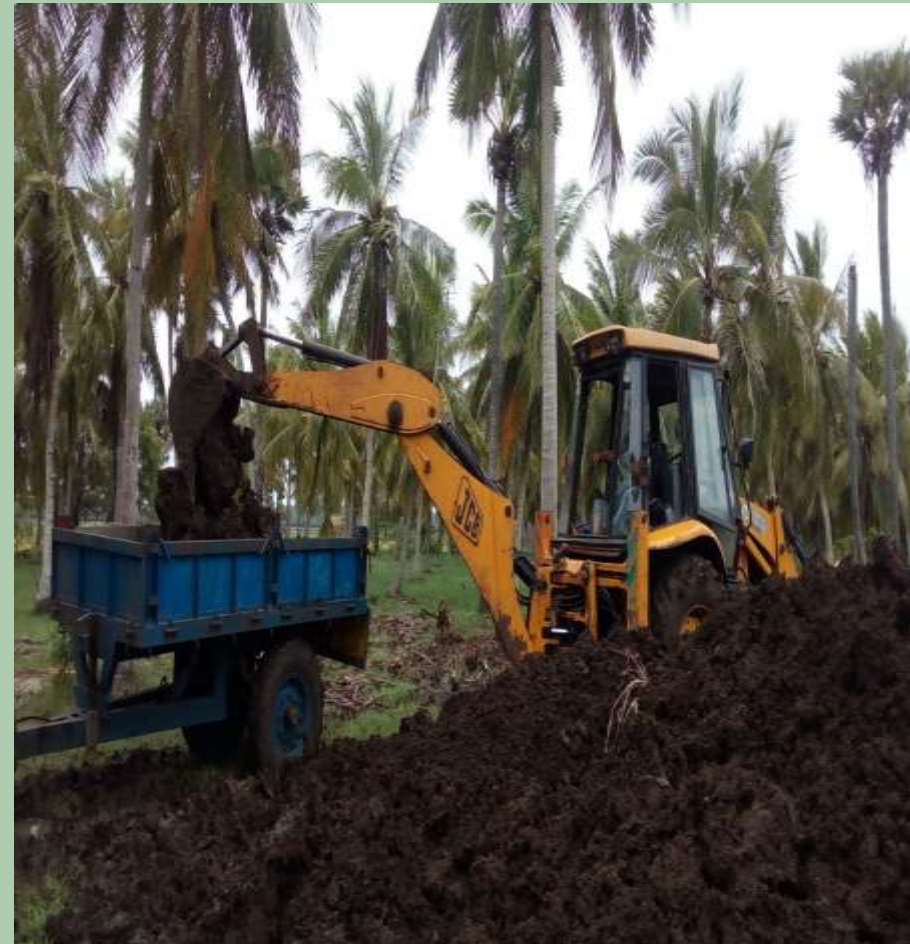
Site levelling at Palakol