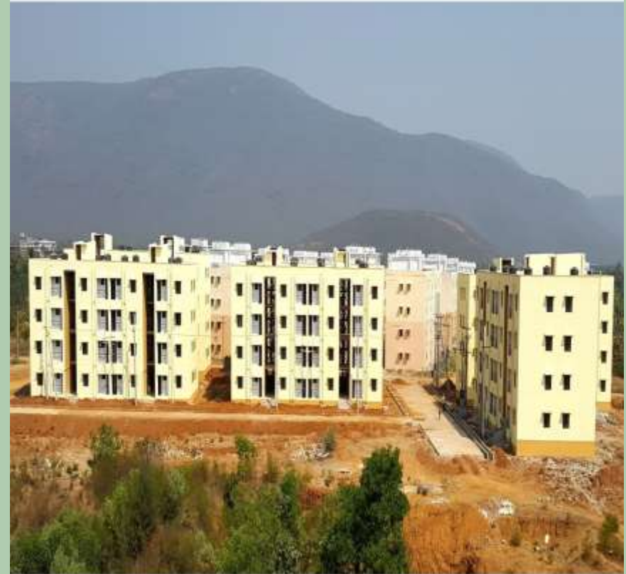
KOMMADI S.NO. 119 OF GVMC