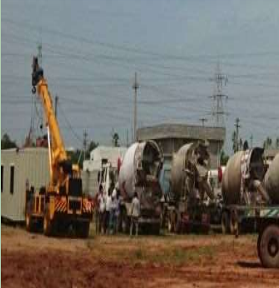
Machinery at Tadepalligudem