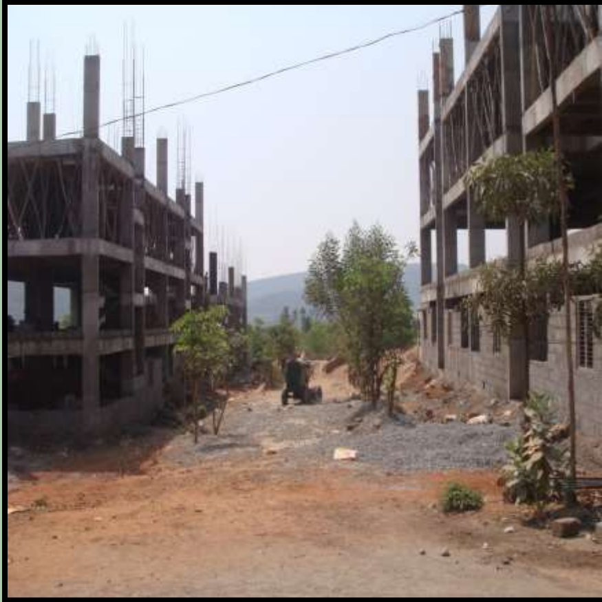
Cyber Valley of Madhurawada