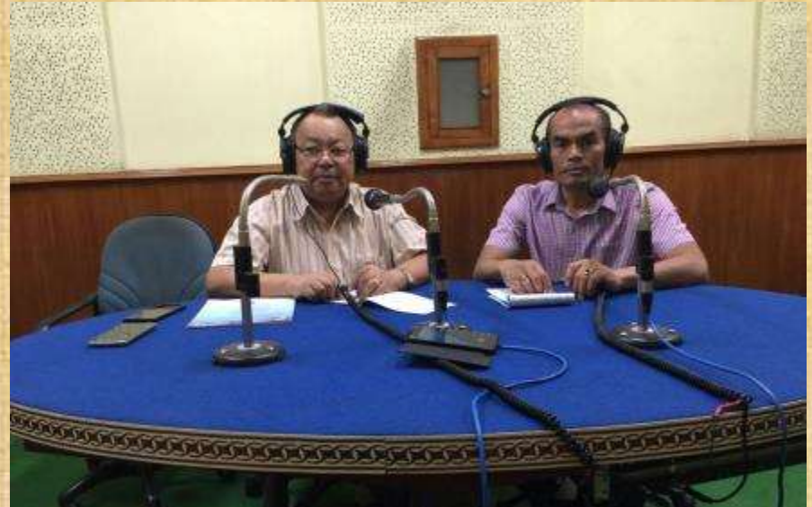
AIR Phone-in Prog on 25/08/2016