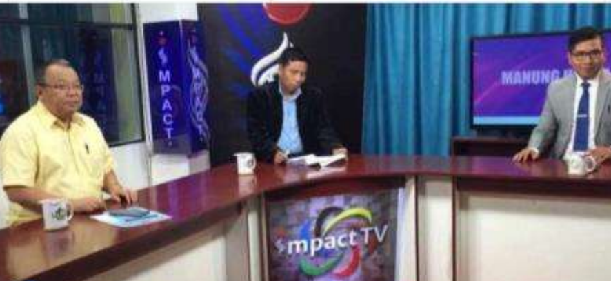
Panel Discussion on IMPACT TV