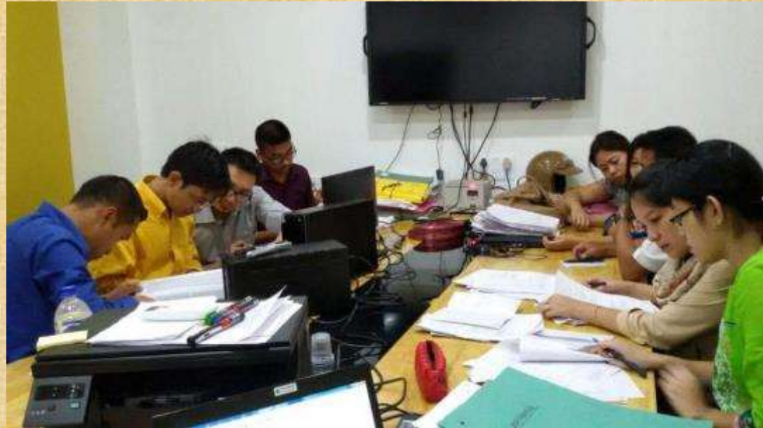
A Team of Officers scrutinizing the demand survey forms