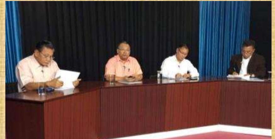
Panel Discussion on ISTV 08/08/2016