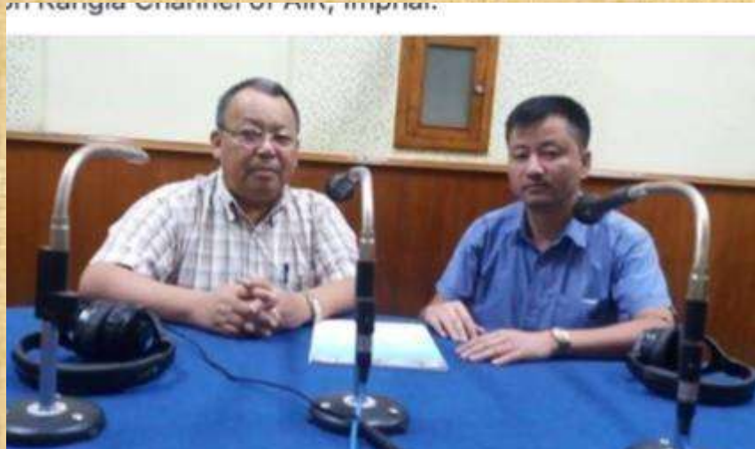
AIR Imphal Newsreel on 21/08/2016