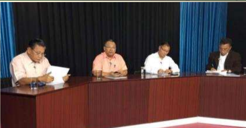
Panel Discussion on ISTV 08/08/2016