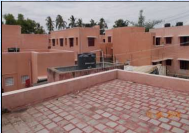
Community Hall – 12.05.2016