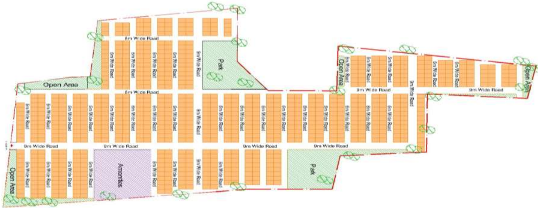
PROPOSED LAYOUT OF SURVEY NO: 18/2,19/02,20/2,21/2,22/2,38/2,58/2 & 58/3 PONNALA ,SIDDIPET MANDAL.MEDAK DIST.