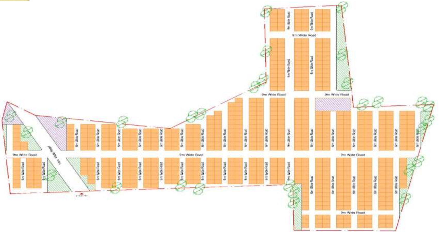
PROPOSED LAYOUT OF SURVEY NO: 129 NARSAPUR SIDDIKET MANDAL.MEDAK DIST.