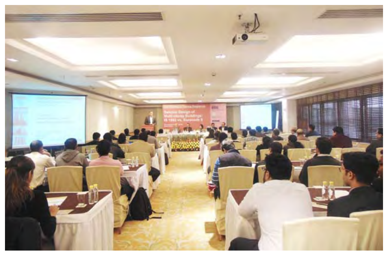
Indo-Norwegian Training Programme on Seismic Design of Multi-storey Buildings: IS 1893 vs. Eurocode 8 organised from December 8-10, 2016