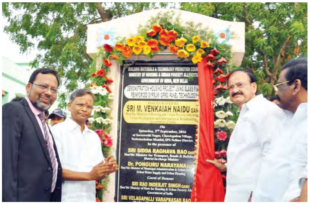
Shri M.Venkaiah Naidu, the then Hon'ble Minister of Housing & Urban Poverty Alleviation, Urban Development and Information & Broadcasting, inaugurating the the Demonstration Housing Project at Saraswathi Nagar, Venkatachalam Mandal, SPS Nellore District on September 3, 2016