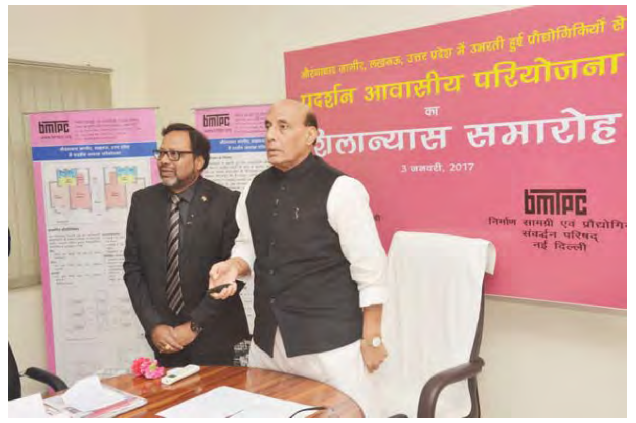
Shri Rajnath Singh, Hon'ble Union Home Minister, Govt. of India laying the Foundation Stone of Demonstration Housing Project at Lucknow, Uttar Pradesh through video conferencing on January 3, 2017