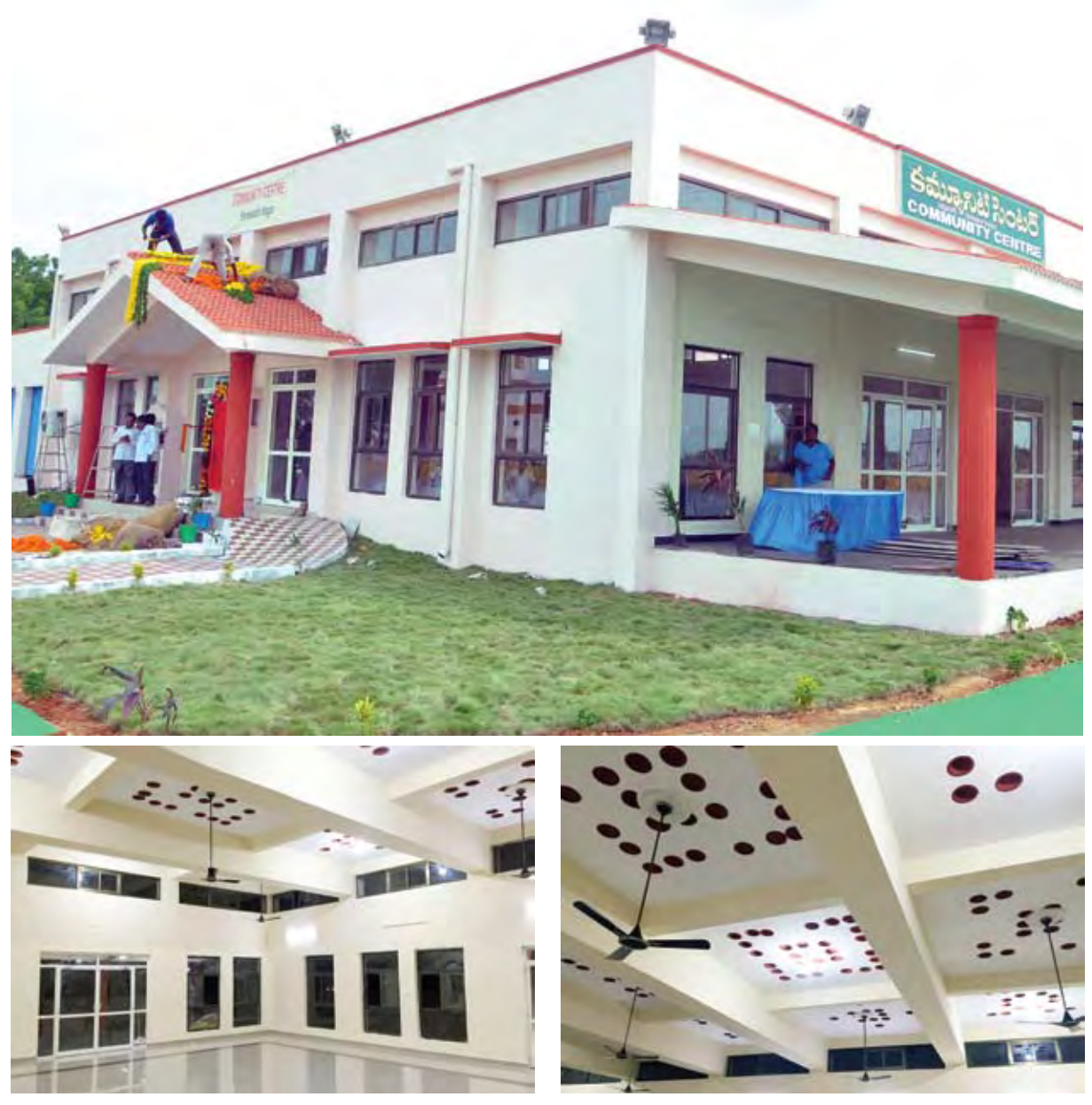
Demonstration Community Building at Saraswathi Nagar, Venkatachalam Mandal, SPS Nellore District, Andhra Pradesh