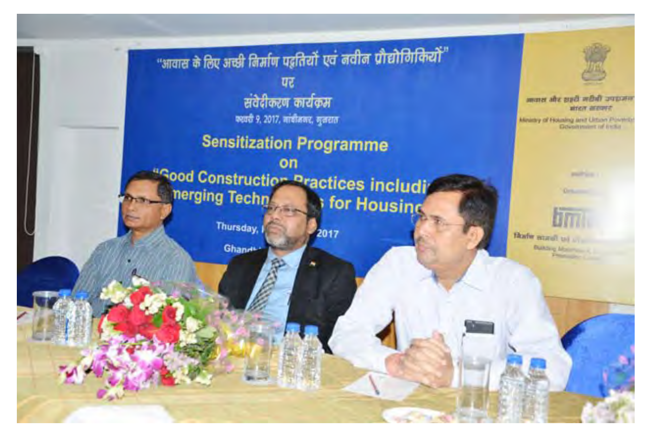
Capacity Building Programme on Good Construction Practices including Emerging Technologies for Housing organised at Gandhinagar, Gujarat on February 9, 2017