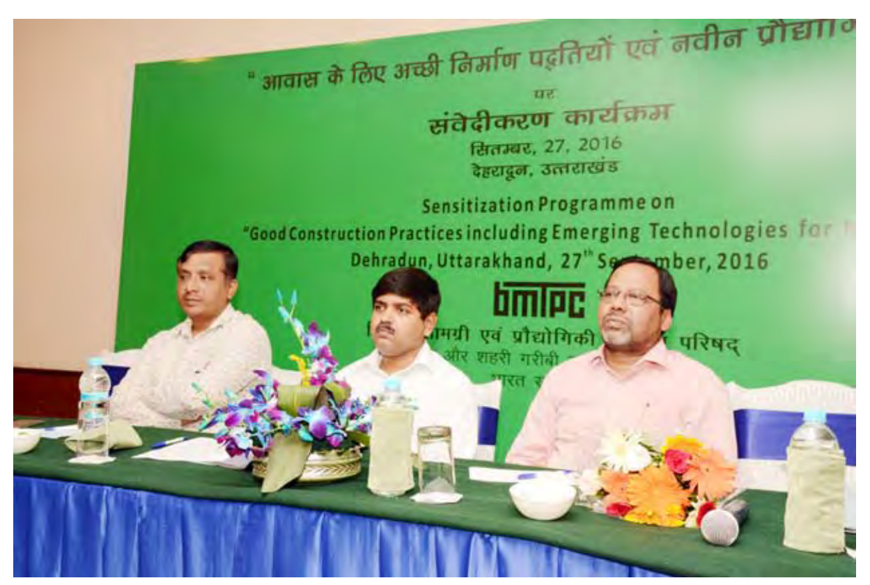
Capacity Building Programme on Good Construction Practices including Emerging Technologies for Housing organised at Dehradun, Uttarakhand on September 27, 2016

Building Materials & Technology Promotion Council