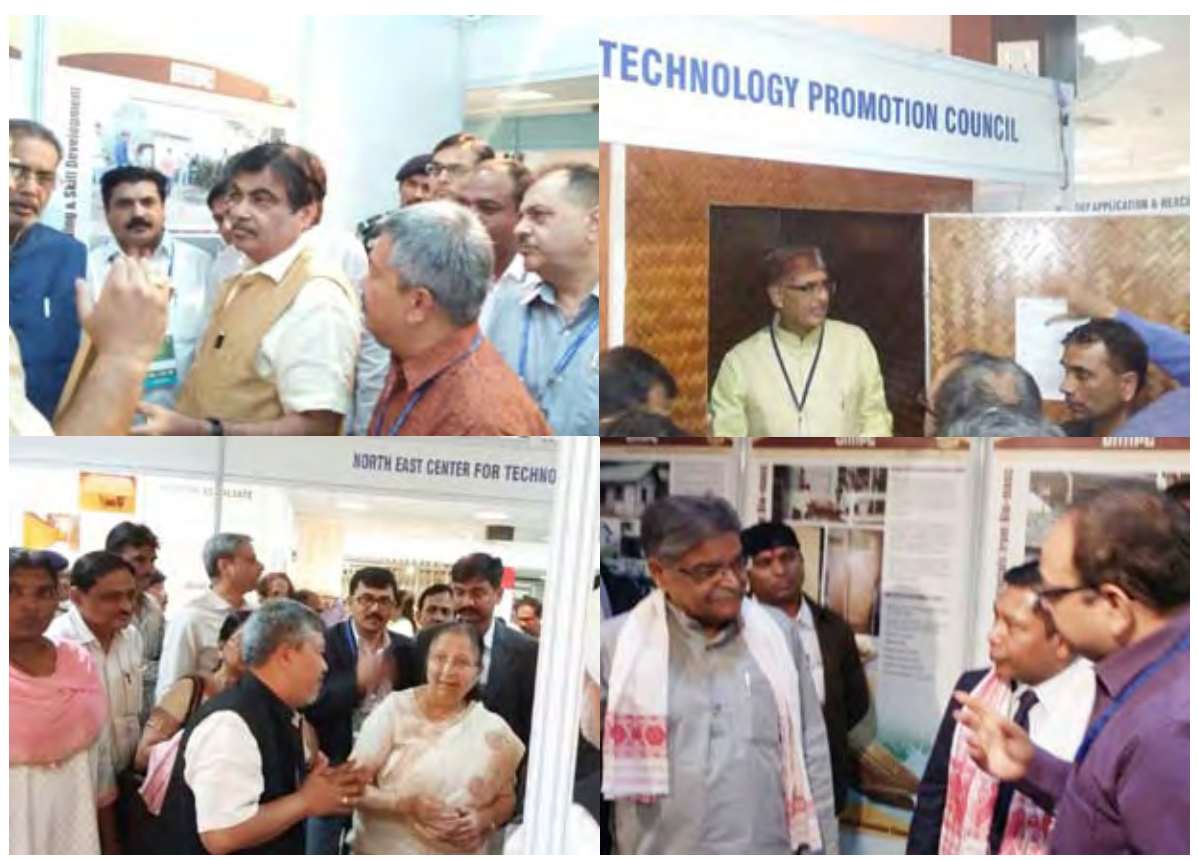
Visit of VVIPs to the BMTPC Display at Global Bamboo Summit organized by Madhya Pradesh State Bamboo Mission (MPSBM) & Indian Federation of Green Energy (IFGE) from April 8-10, 2016 at Indore (MP)