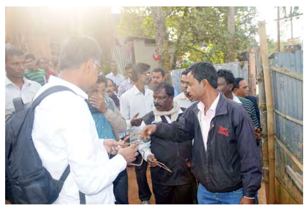
Hands-on Training Prgramme for Masons on "Good Construction Practices include Disaster Resistant Construction" conducted on January 20, 2017 alongside the PMAY(U) Workshop.

"Training on Good Engineering Practices including Disaster resistant aspects in Construction" were imparted to ULB/State engineers & construction professionals from North Eastern areas during the Regional Workshop on PMAY (Urban) on 20-21 January, 2017 at Agartala, Tripura.