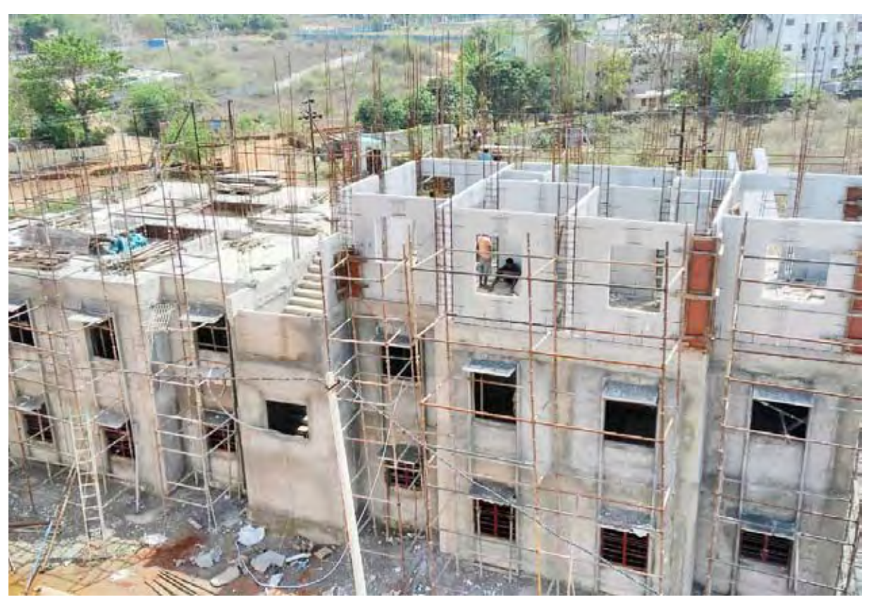
Construction of Demonstration Housing Project at Bhubaneswar, Odisha