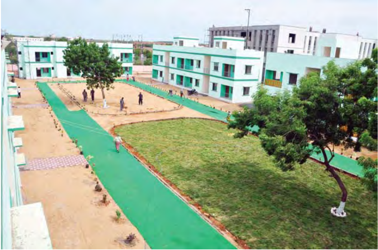
Completed Demonstration Houses at Saraswathi Nagar, Venkatachalam Mandal, SPS Nellore District, Andhra Pradesh