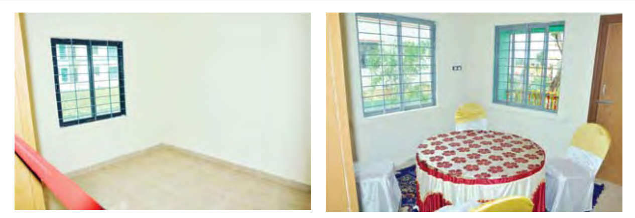
Inside view of DUs of Demonstration Houses at Saraswathi Nagar, Venkatachalam Mandal, SPS Nellore District, Andhra Pradesh