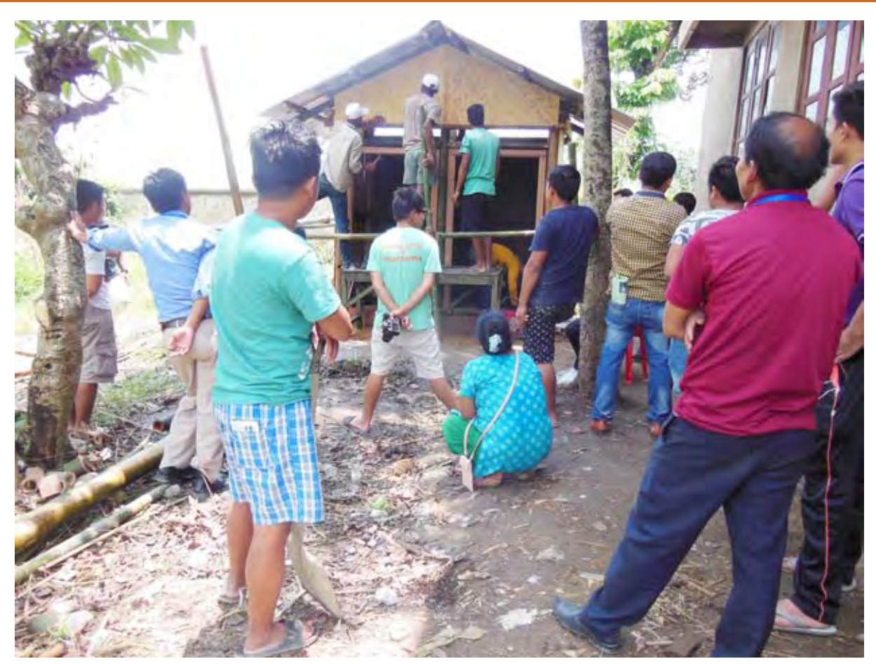
Construction of Toilet during Training Programme on "Bamboo based Toilet Building" at Imphal, Manipur from May 13-17, 2016