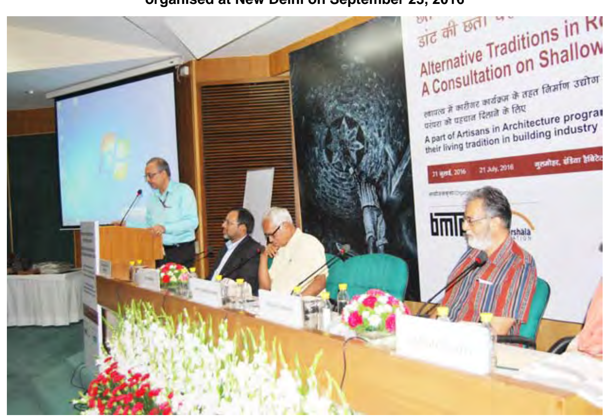
Consultation on "Shallow Masonry Domes - Alternative Traditions in Roofing Systems" organised at New Delhi on July 21, 2016