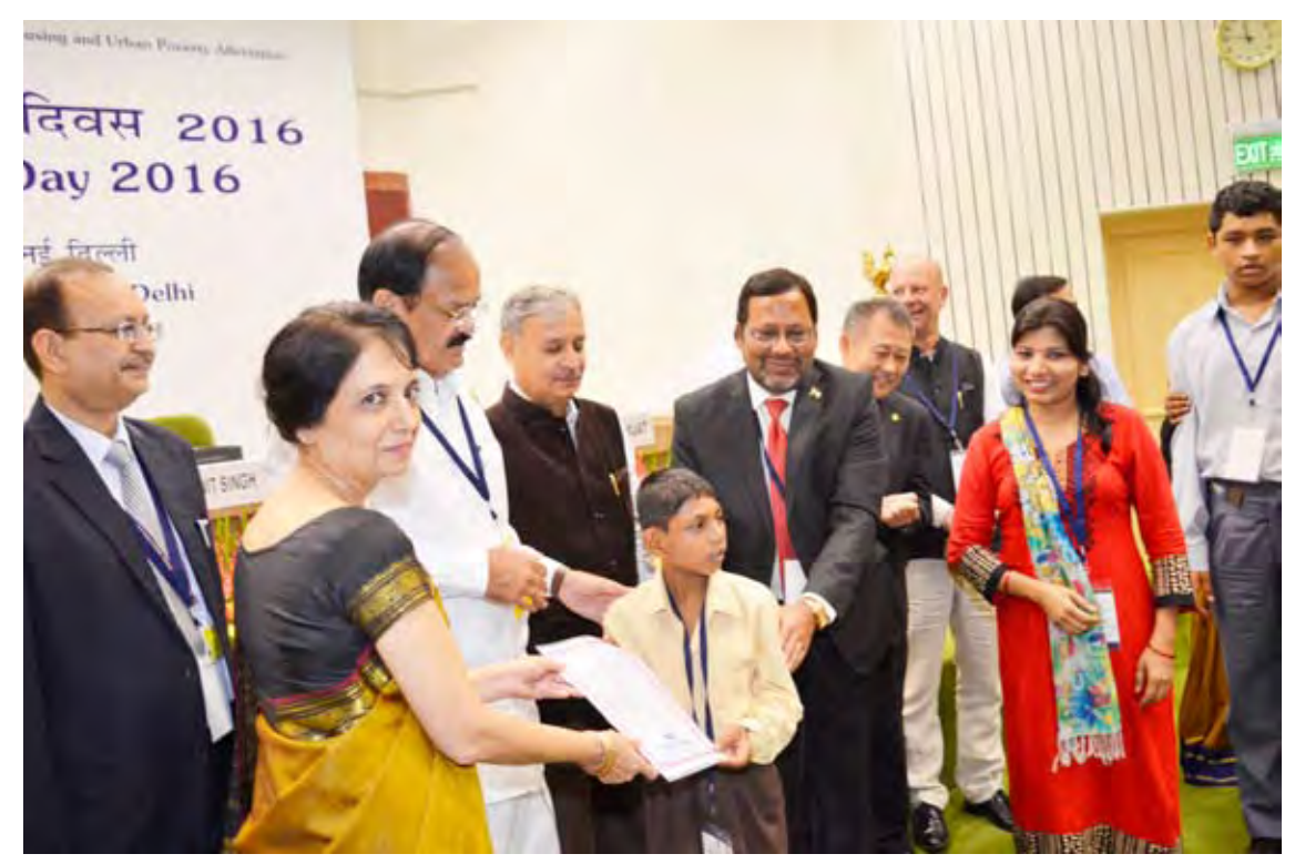
Shri M. Venkaiah Naidu, the then Minister of Housing and Urban Poverty Alleviation along with other dignitaries giving away the Prizes to the winners of Painting Competition of Differently Abled Children organised by BMTPC during the World Habitat Day on October 3, 2016 at New Delhi