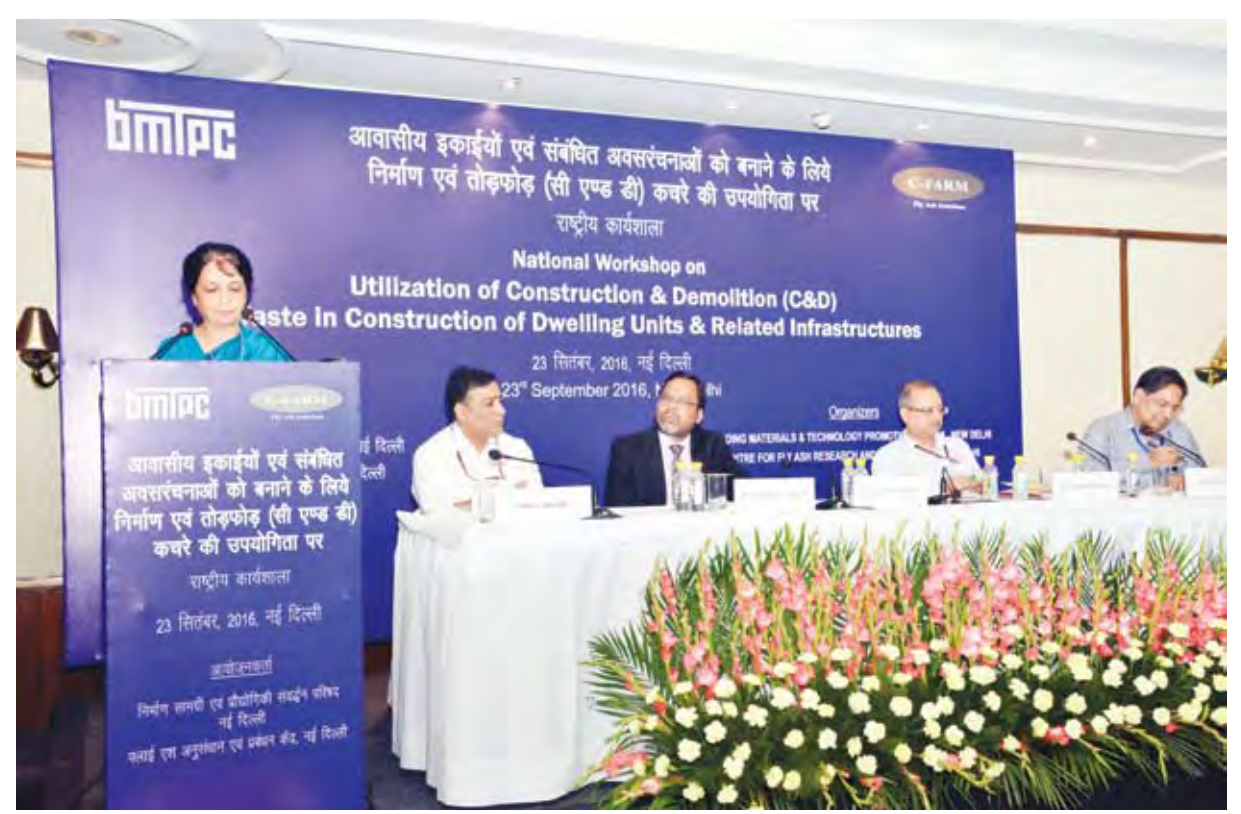
National Workshop on "Utilization of Construction & Demolition (C&D) Waste in Construction of Dwelling Units & Related Infrastructures organised at New Delhi on September 23, 2016