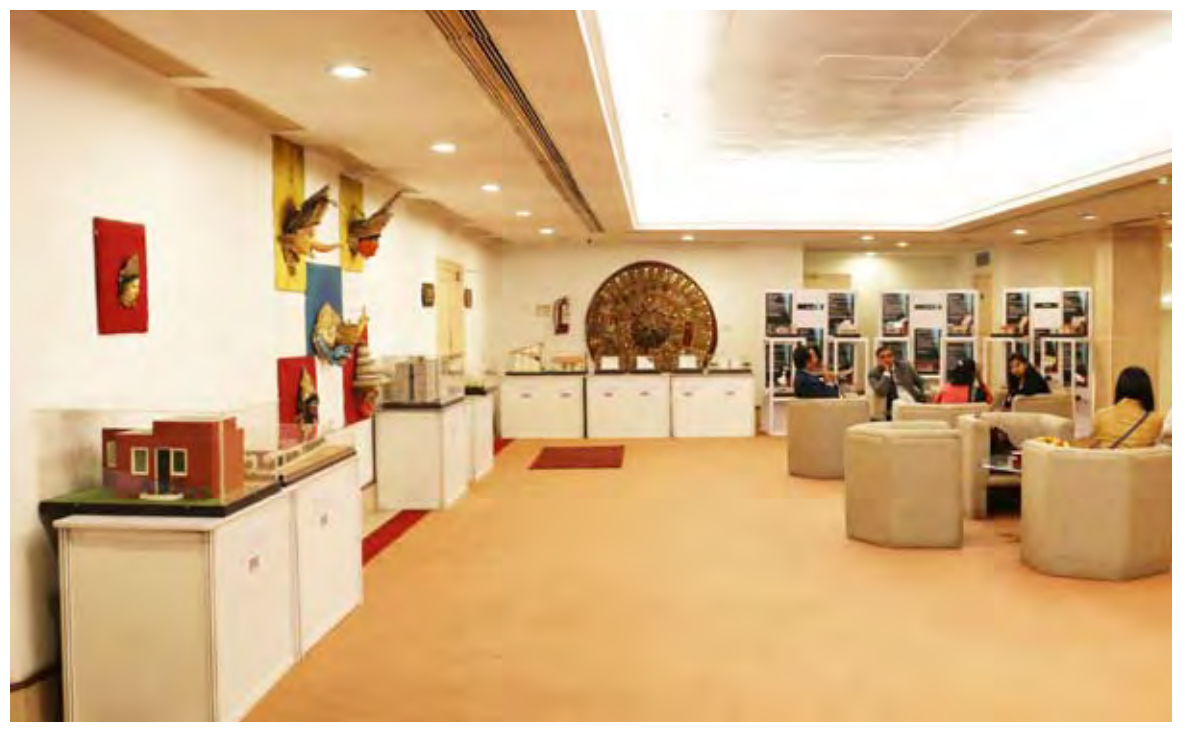
Alternate Housing Technologies being display through Models during 6<sup>th</sup> Asia Pacific Ministerial Conference on Housing and Urban Development (APMCHUD) organized by Ministry of Housing & Urban Poverty Alleviation at New Delhi from December 14-16, 2016