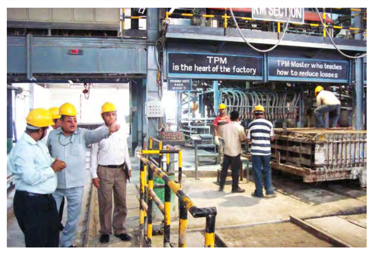
Inspection of Works of Prefabricated Fibre Reinforced Sandwich Panels of Hyderabad Industries Ltd., Hyderabad carried out by the BMTPC alongwith TAC members on November 7-8, 2016 under PACS