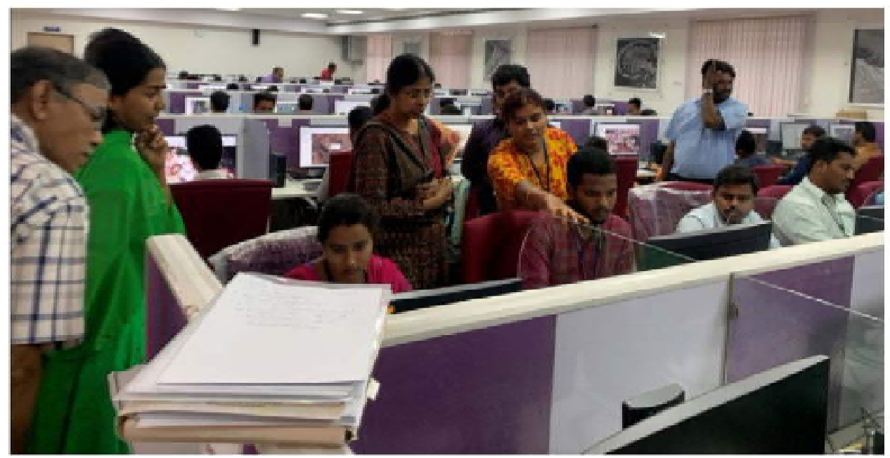
Visit of JS (AMRUT) to Geo-database Generation Facility at NRSC, Hyderabad under Sub-Scheme on Formulation of GIS-based Master Plans for AMRUT Cities