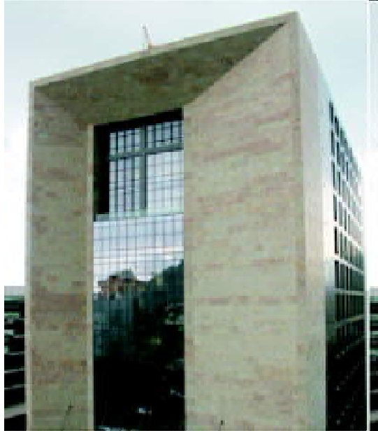
Construction of New Supreme Court Building, Port Louis, Mauritius