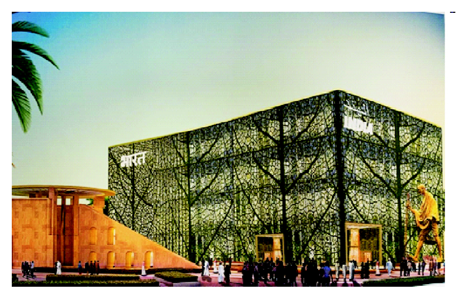
Construction of Indian Pavilion at Dubai World Expo, 2020