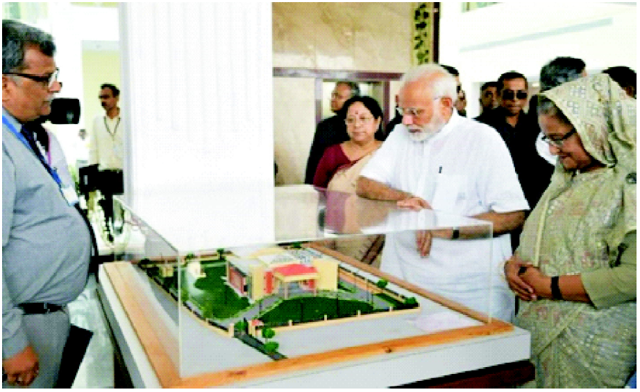
Bangladesh Bhawan, Kolkata