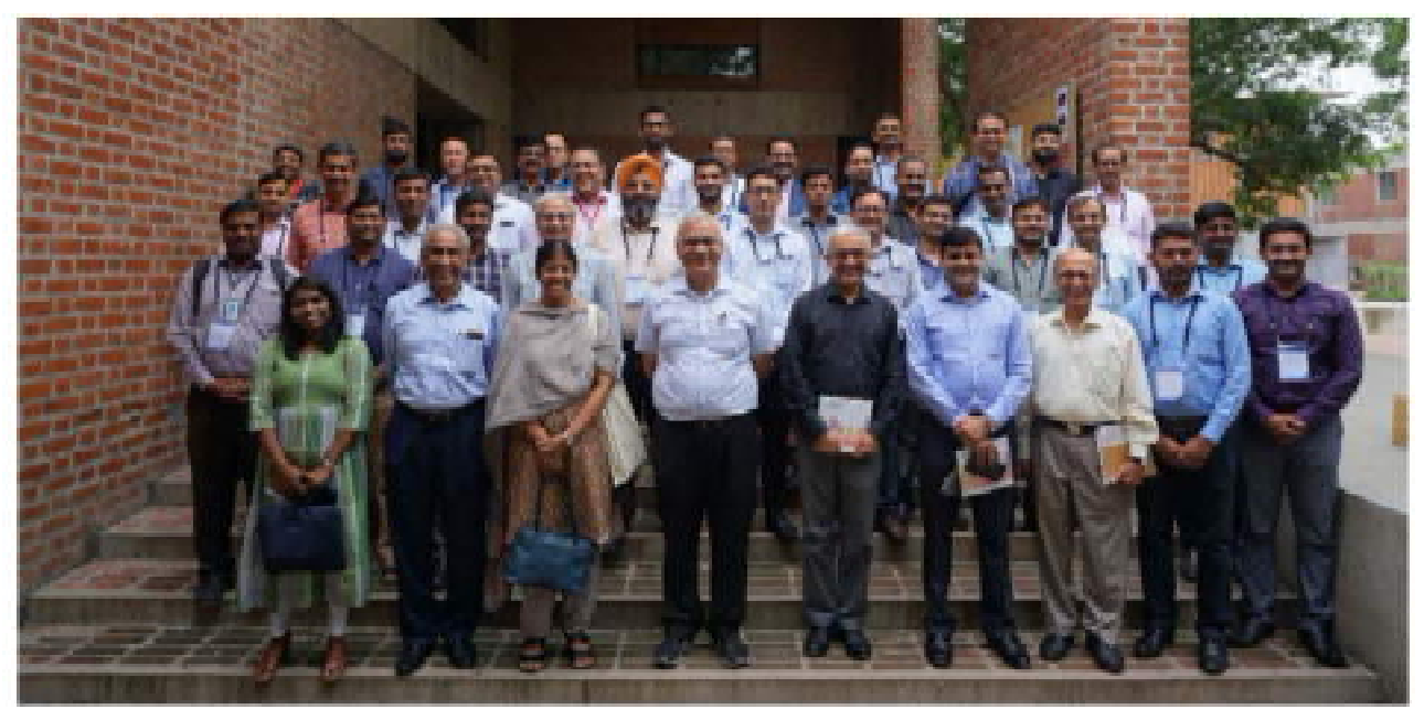
Secretary MoHUA and JS (AMRUT) grace the LAP-TPS Workshop at CEPT Ahmedabad