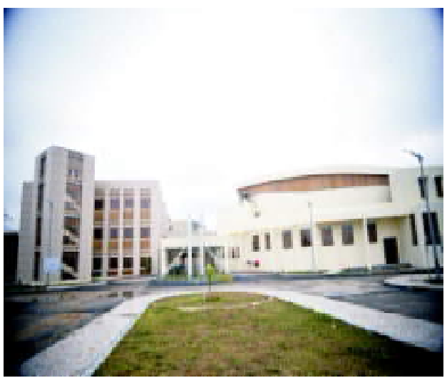
National Institute of Design NID, Jorhat, Assam