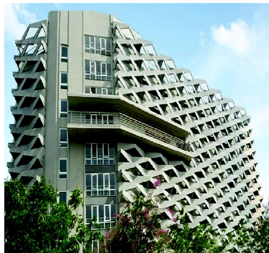
Screening of Utilities

The Commission has prepared guidelines on significant aspects of Cityscape which would complement the development of Smart cities and are expected to enhance the environmental quality, aesthetics of not only the Capital City but could be adopted by the other metropolitan cities in the Country. Some of the significant completed and ongoing guidelines are enumerated below.