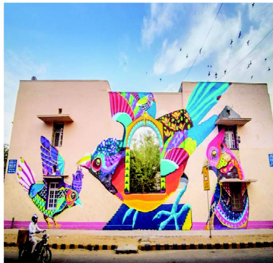
Art in Public Places