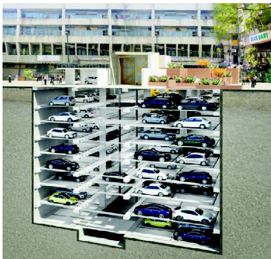
A Multilevel Car Parking Option