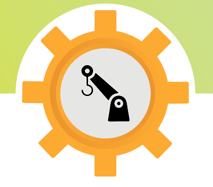
Identifying and Mainstreaming Proven Demonstrable Technologies for the Construction of Lighthouse Projecs