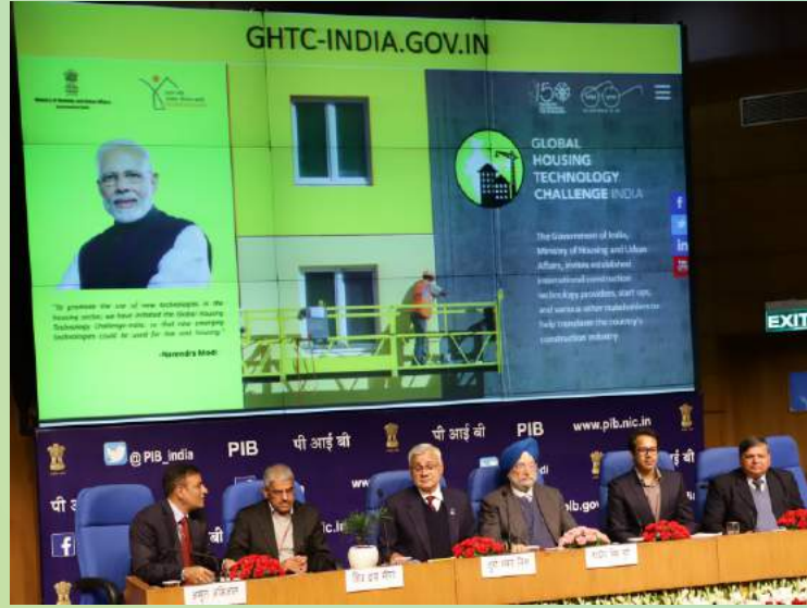
Launch of GHTC Website

MoU exchange with Knowledge Partners, Launch of GHTC-India Logo, Website & Mobile App and Launch of Book on 'Sustainable Building Technology' took place at the event.