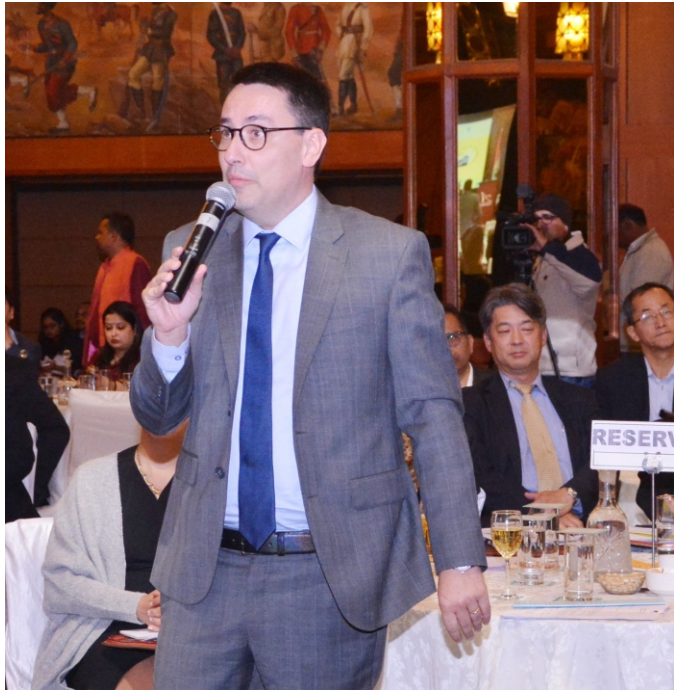
Interactions by guests during the session