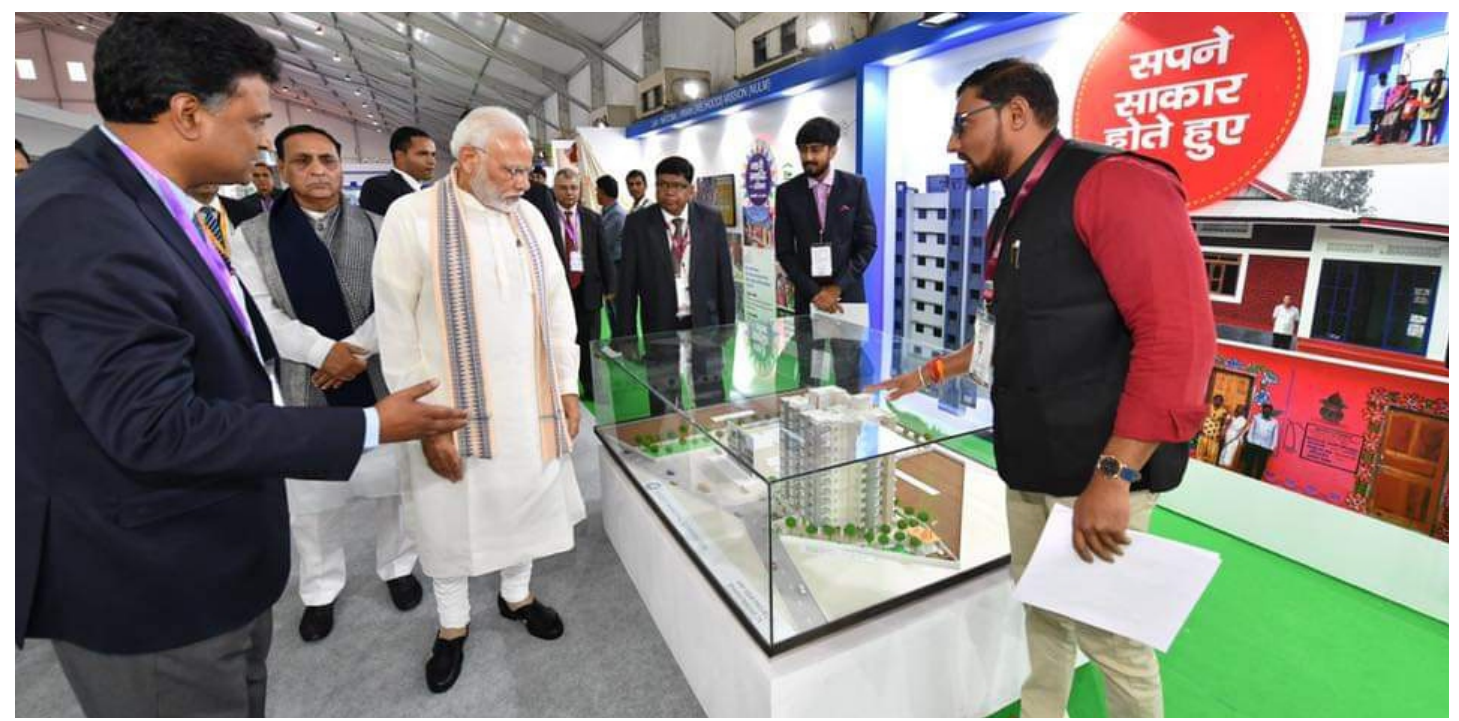
Hon'ble PM's visit on PMAY(U) stall in Vibrant Gujarat Event