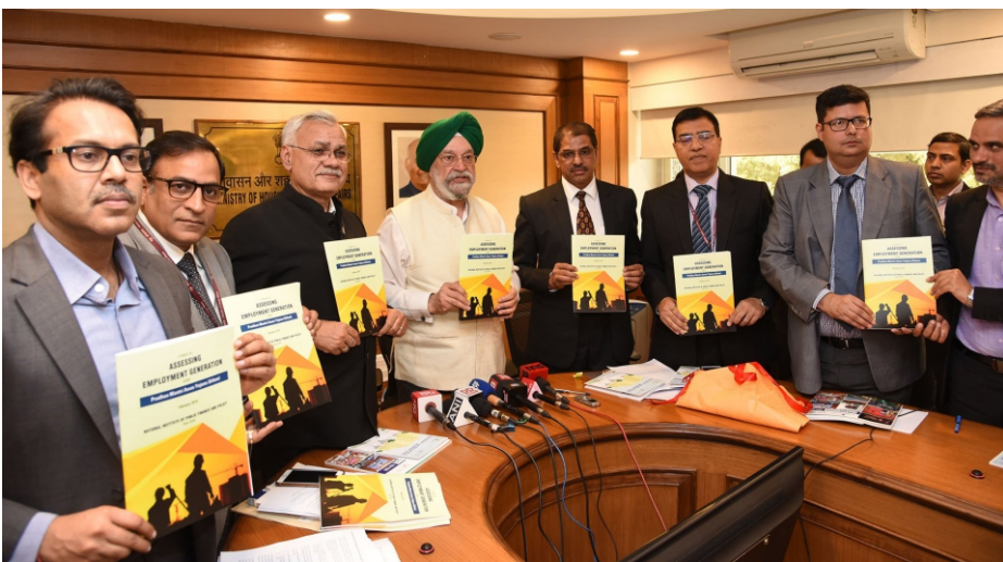
Shri Hardeep S Puri, Minister of State (IC), MoHUA along with other Government officials releasing report and UT compendium