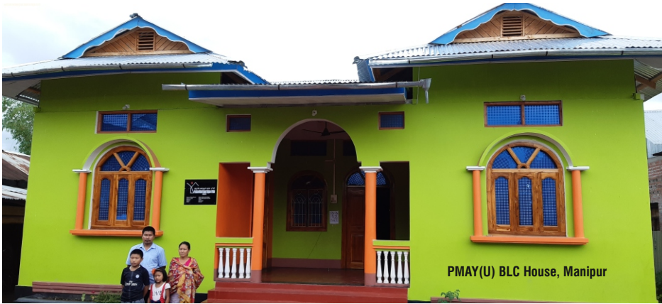
PMAY(U) BLC House, Manipur