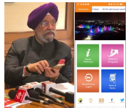
Hon'ble Minister of State (I/C), MoHUA, Shri Hardeep S Puri launching the PMAY(U) Mobile app

New mobile application for PMAY(U) was launched by Hon'ble Minister of State (I/C), MoHUA, Shri Hardeep S Puri in the month of February, 19. The mobile app has been designed for easy access and interface of beneficiaries with PMAY(U) Mission. Through this mobile app beneficiaries can capture and upload high-resolution photographs and video clips highlighting their success stories of owning a house under PMAY (U). These stories are an emotional recount of experiences such as increased self-esteem, social security, sense of pride and dignity. The mobile app has marked its reach to more than 50,000 beneficiaries across all States/UTs.