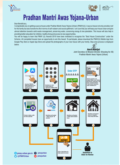
Inland letters sent to PMAY(U) Beneficiaries