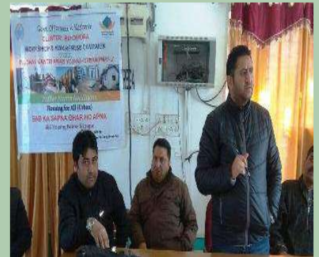
At Sumbal Town