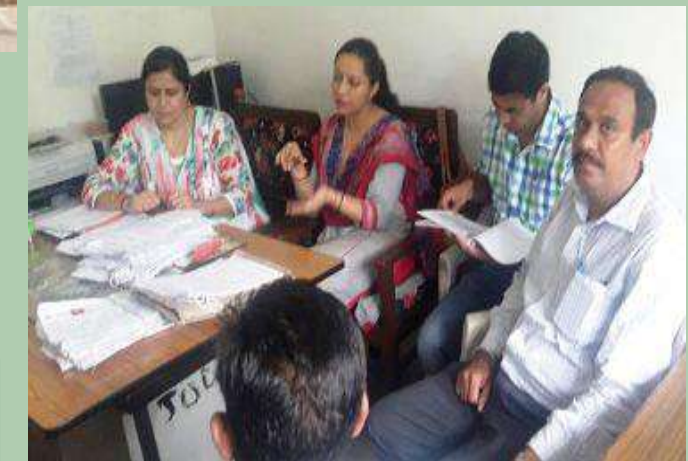
Visit to JUDA office (Sponsoring agency for CLSS) during training programme.