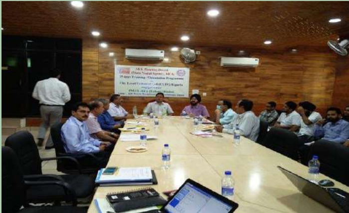
15 days training programme for CLTC Experts.