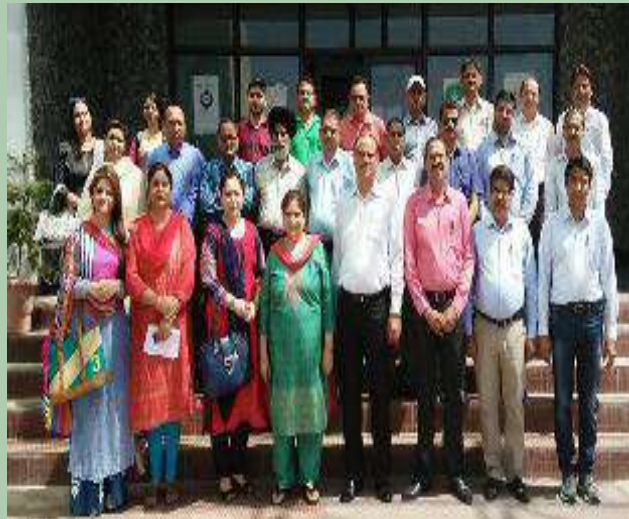
During 3 day training programme organized by J&K Institute of Management & Public Administration (IMPA) at Jammu.