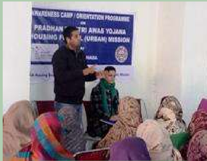
At Gho Manhasa Town