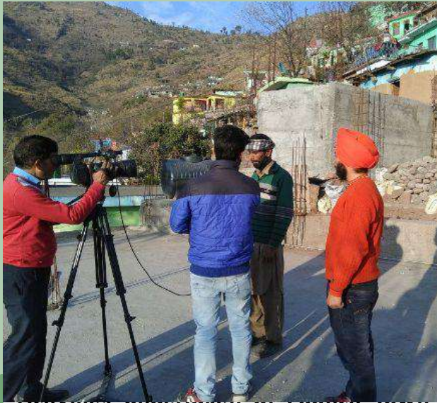
Archives broadcasted on Poonch town via Doordarshan TV Channel