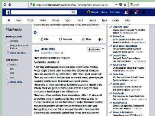
Social Media Campaign by CLTC/SLTC Experts via Facebook