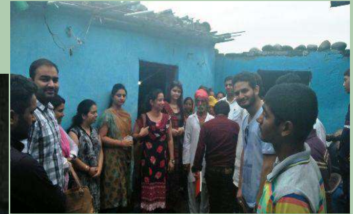
Exposure visit of CLTC experts to one of the slum of Jammu Municipal Corporation.