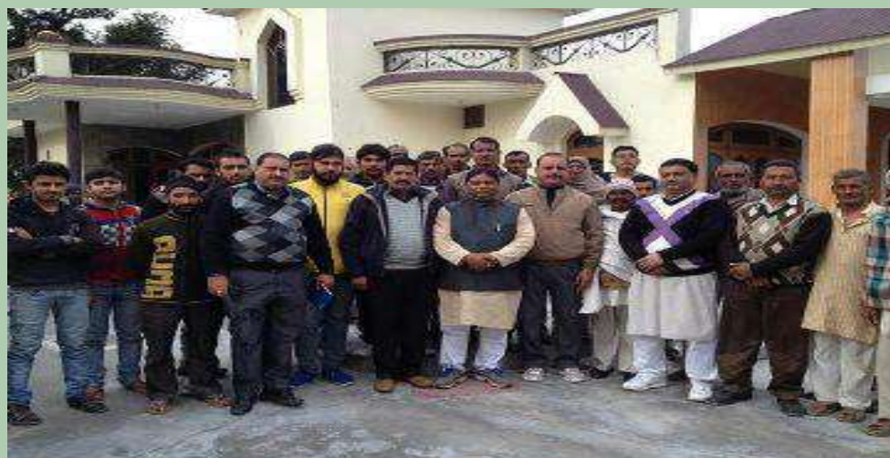
MLA Jammu West during interaction with intending beneficiaries of PMAY (U) Mission.