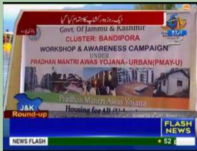
Broadcast of workshop on awareness campaign on PMAY (U) Mission on ETV Urdu.