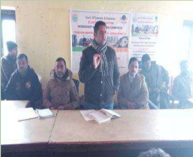
At Bandipora Town

Participation of real stakeholders in these consultative meetings on PMAY Mission.