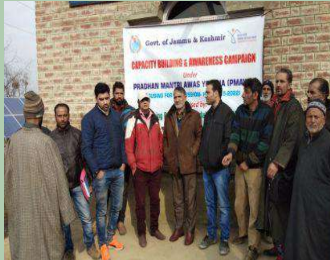
At Langate Town