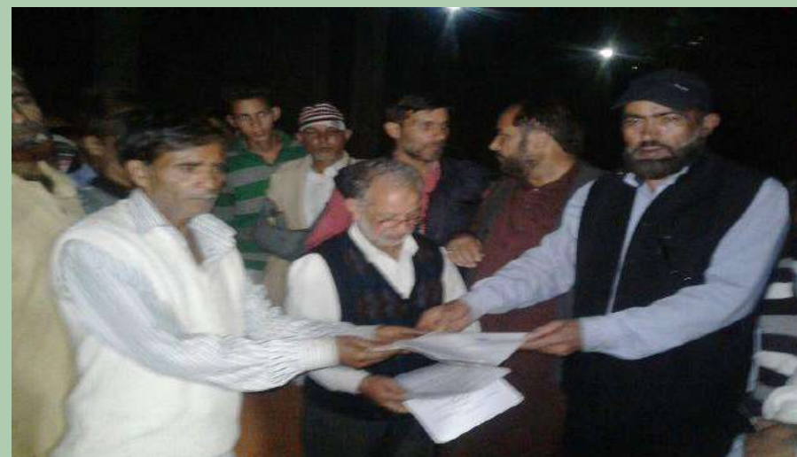
MLA Poonch handing over award letters to the identified beneficiaries.