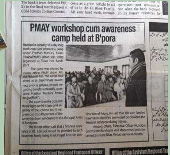
New published on local newspaper of the state regarding awareness campaign on PMAY (U) Mission at Bandipora.