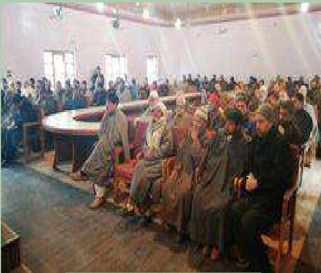
At Budgam Town