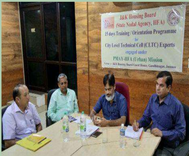
Orientation of newly appointed CLTC experts at J&K Housing board Guest House. Session taken by experts from Ministry of H&UA