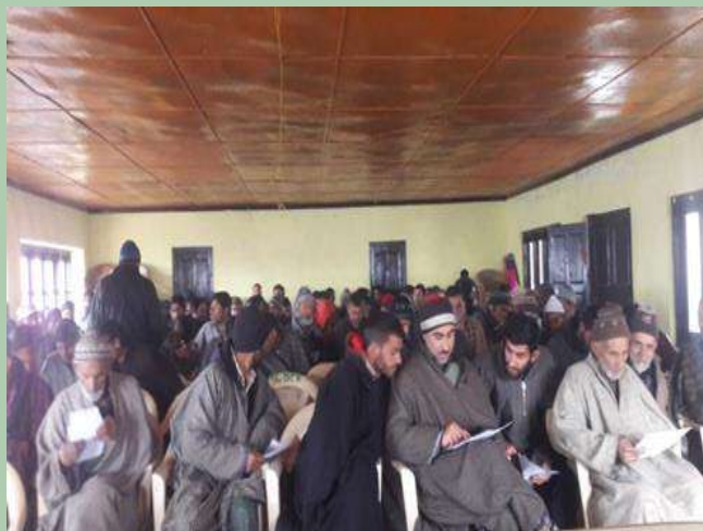
At Badipora Town of Kashmir Division