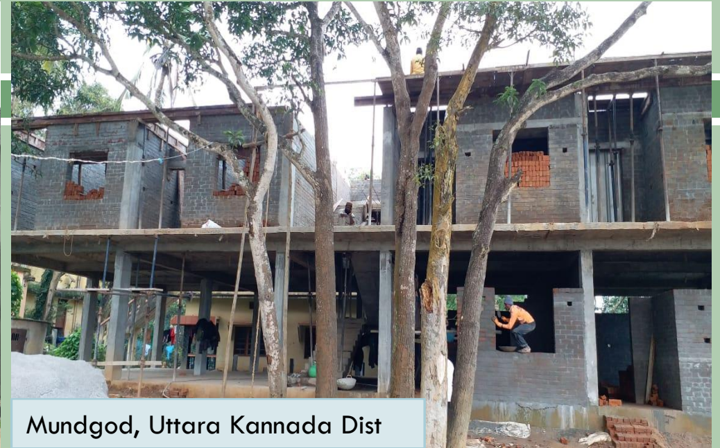
Mundgod, Uttara Kannada Dist