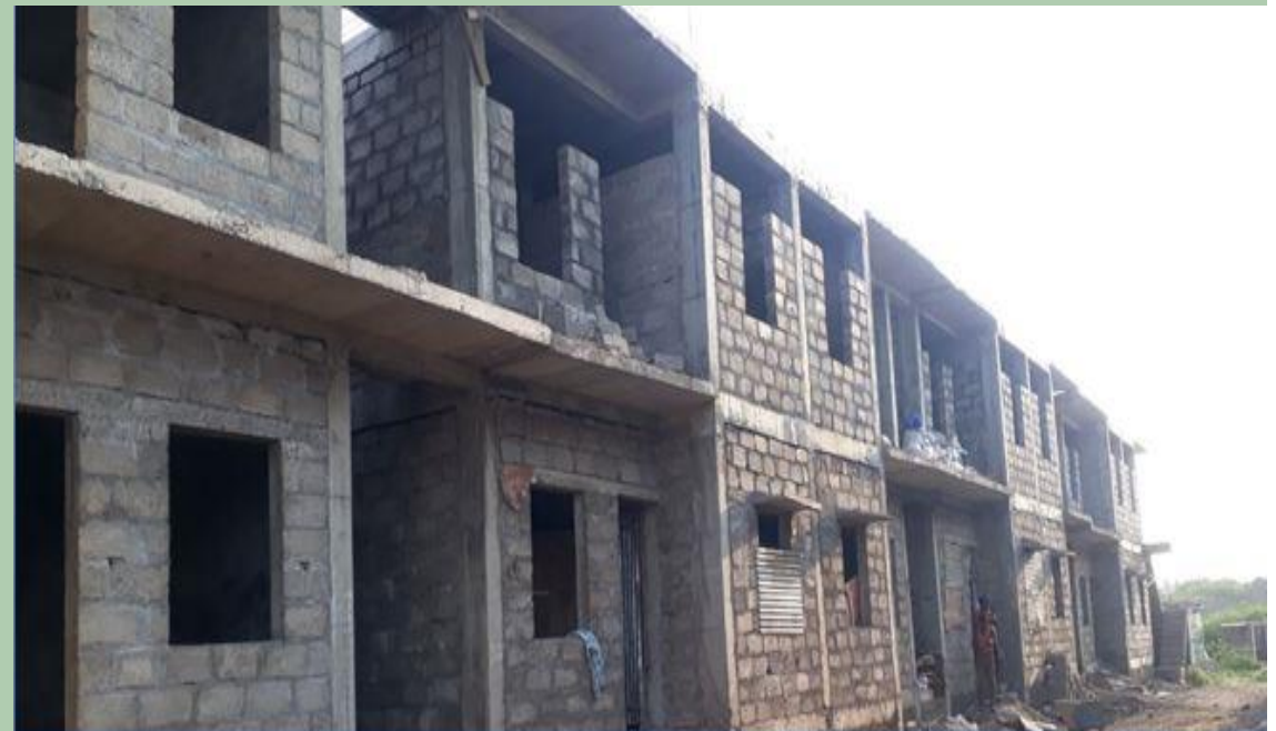
300 DU's CONSTRUCTION OF AHP AT VIJAYAPURA (INDI ROAD)