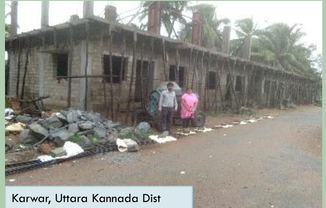
Karwar, Uttara Kannada Dist