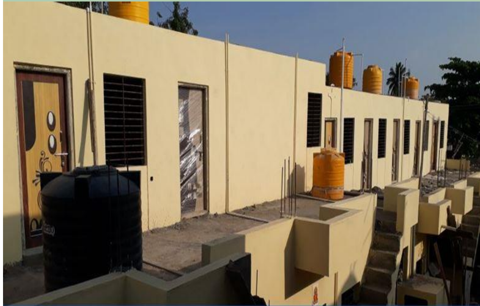
78 DU's AHP CONSTRUCTION (KSDB) AT VIJAYAPURA