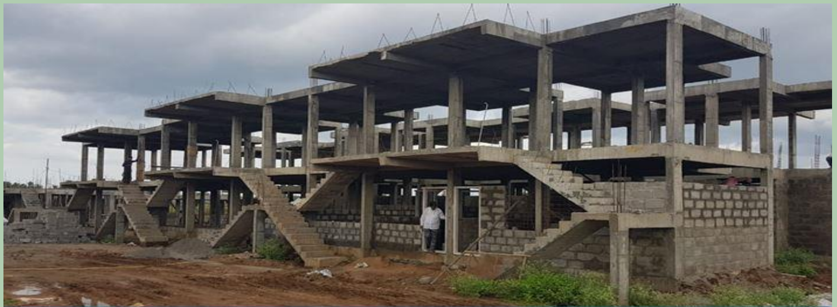
500 DU's CONSTRUCTION UNDER AHP AT BASAVANA BAGEWADI (VIJAYAPURA DISTRICT)