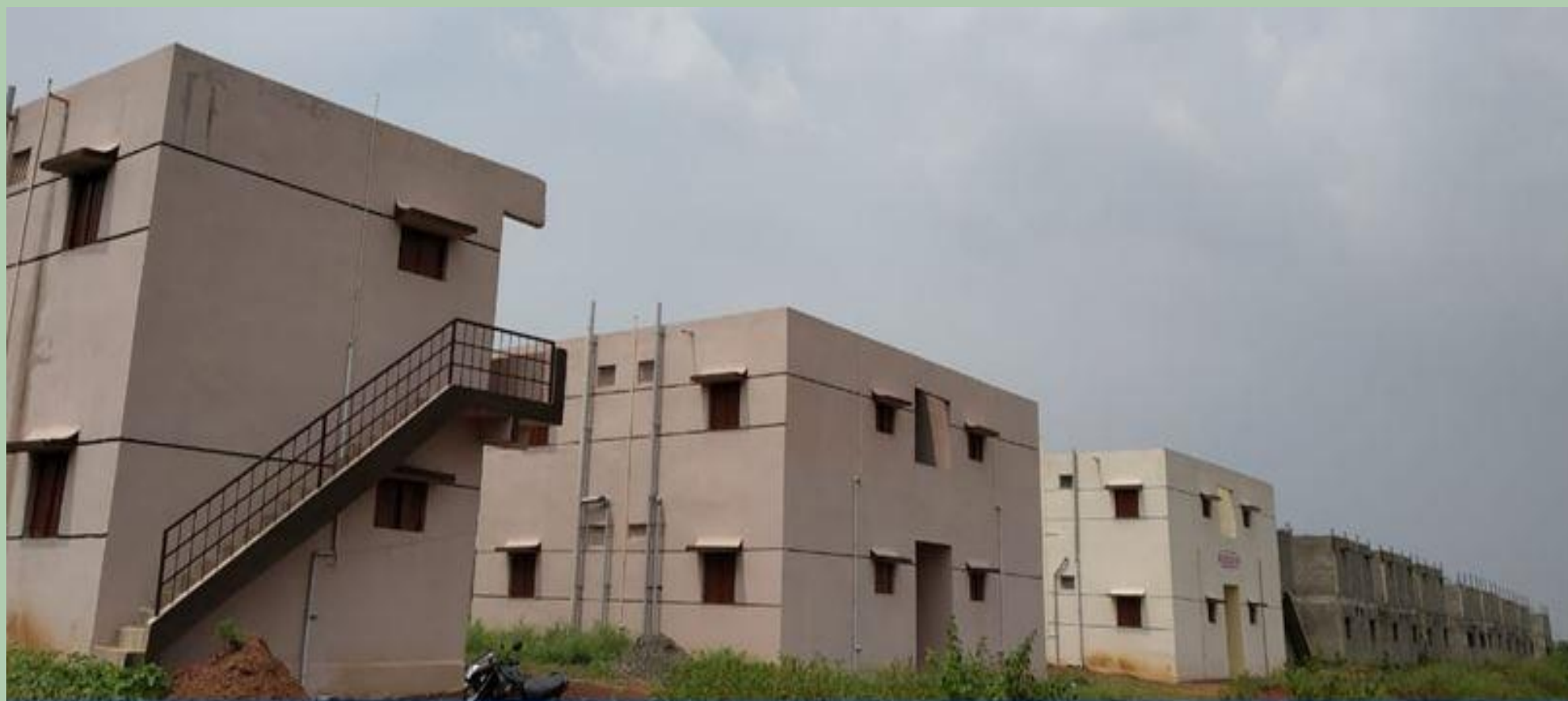
204 DU's AHP CONSTRUCTION AT SHIGGAON (HAVERI DISTRICT)