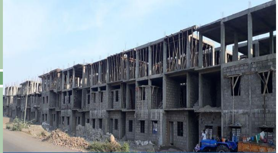
260 DU's CONSTRUCTION UNDER AHP (KSDB) AT VIJAYAPURA