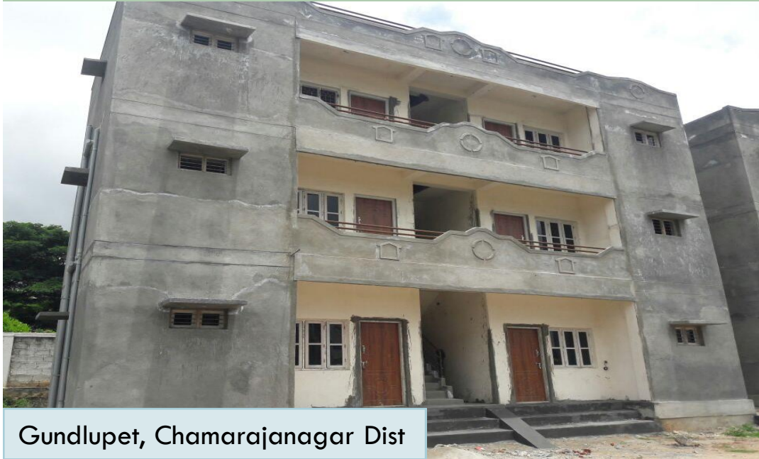
Gundlupet, Chamarajanagar Dist