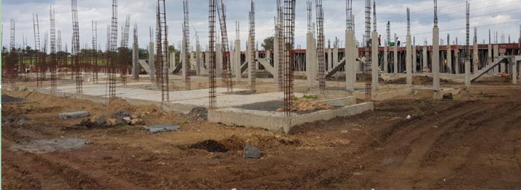
500 DU's AHP CONSTRUCTION AT BASAVANA BAGEWADI (VIJAYAPURA DISTRICT)