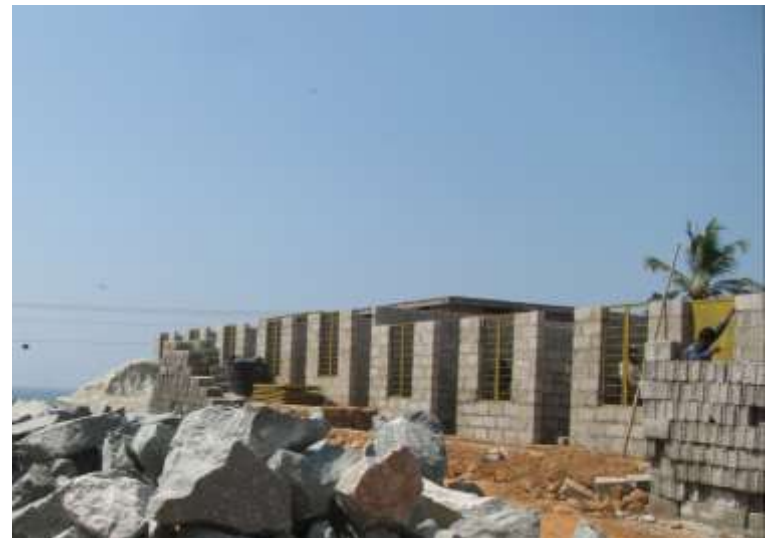
Urban Housing Mission , Local Self Government Department, Kerala