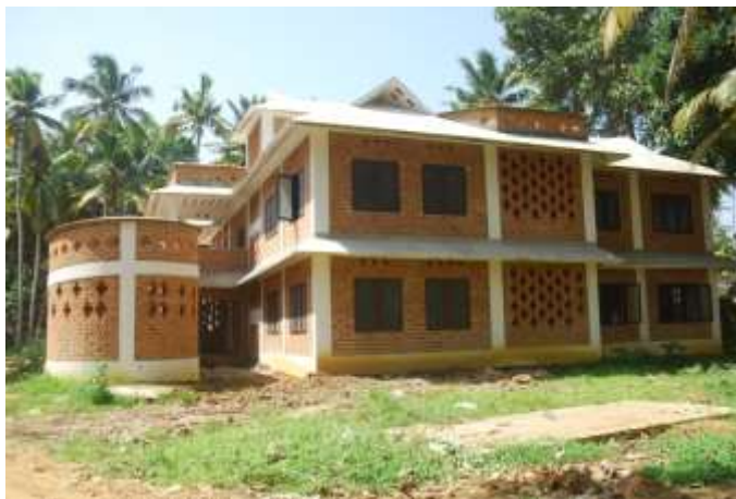
Old age Home