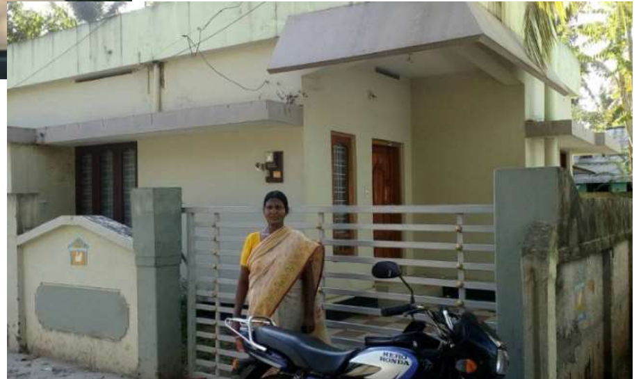
Kudumbashree, Local self Govt Dept., Govt of Kerala