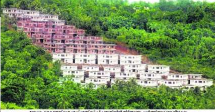
കുളപ്പുറം മെക്കനോൺ മെന്റ എച്ച് എസ് ഡി പി പദ്ധതിയിൽ നിർമ്മാണം പൂർത്തിയാക്കുന്ന വീടുകൾ