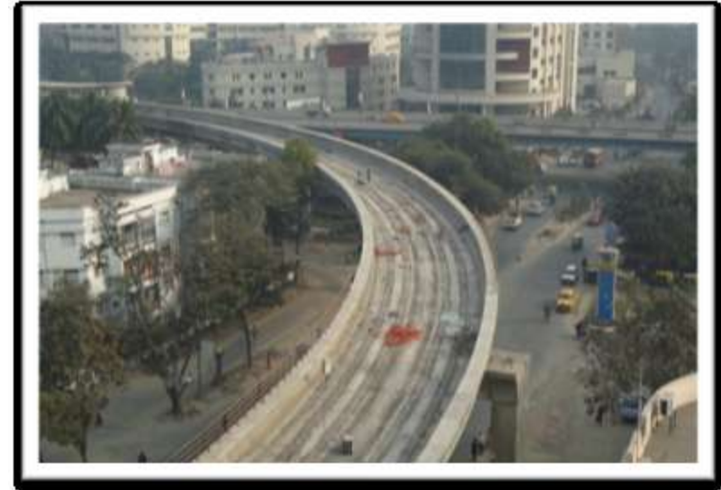
Erected Segmental Span