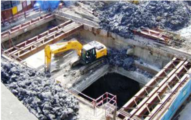
Concourse Slab Excavation Work at Phoolbagan