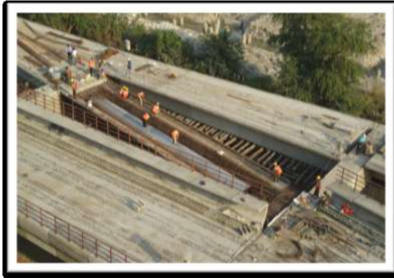
Crossover in Elevated Viaduct