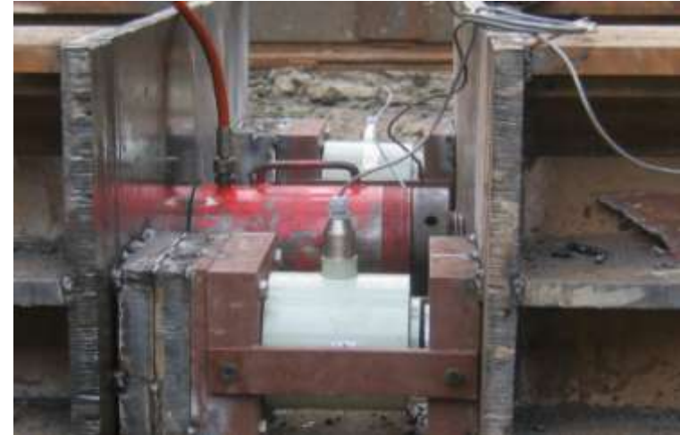
Instrumentation Work at Phoolbagan