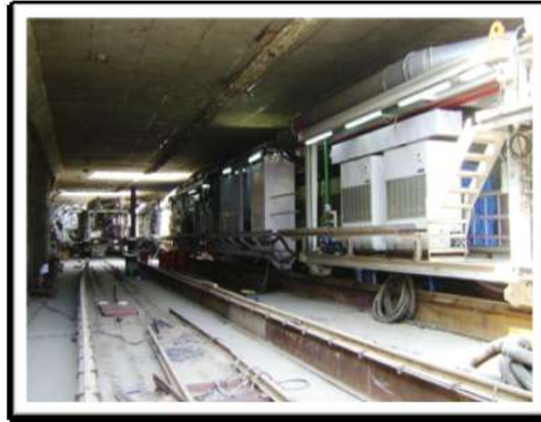
TBM - Installed