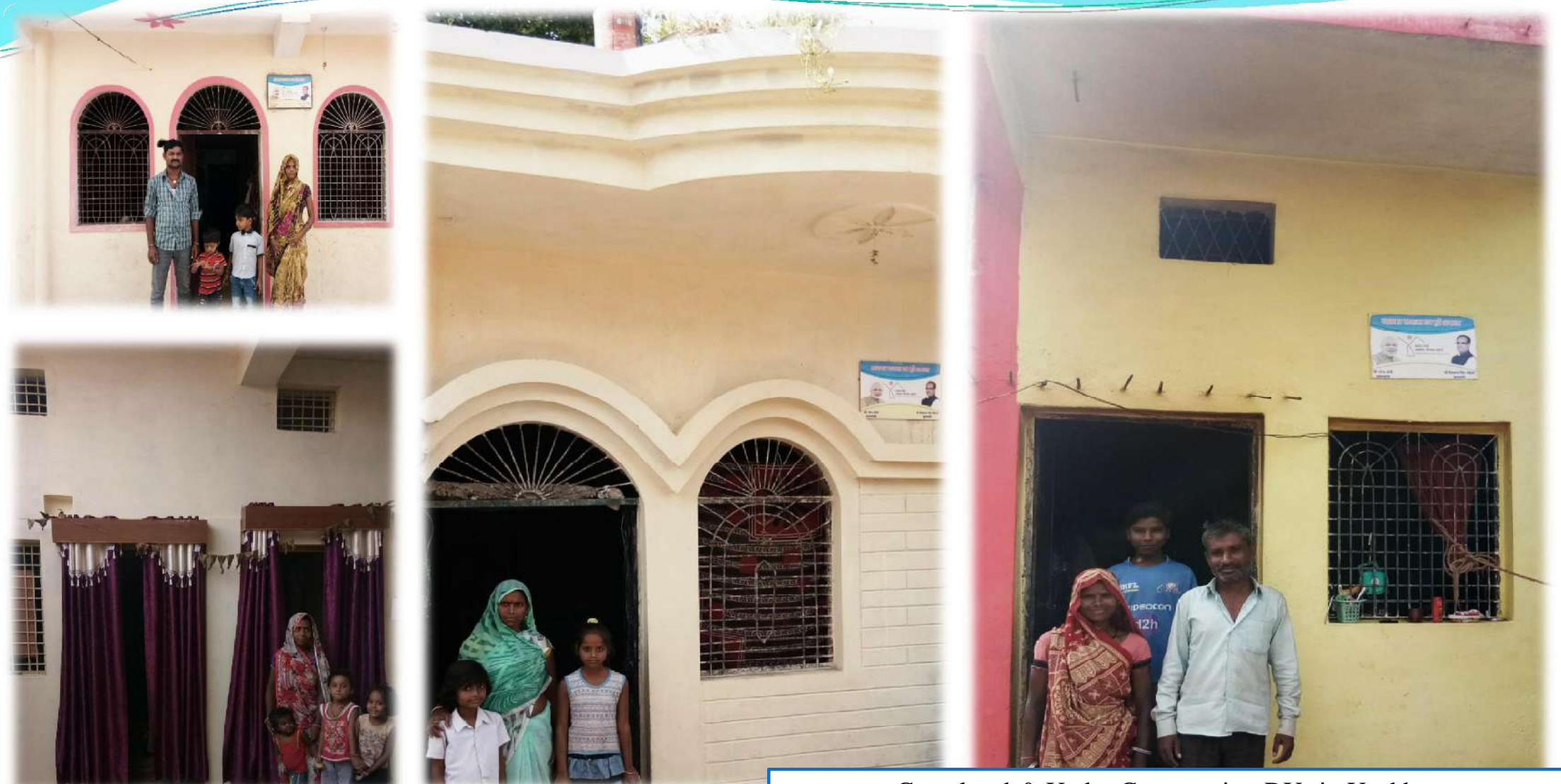
Completed & Under-Construction DUs in Unchhera