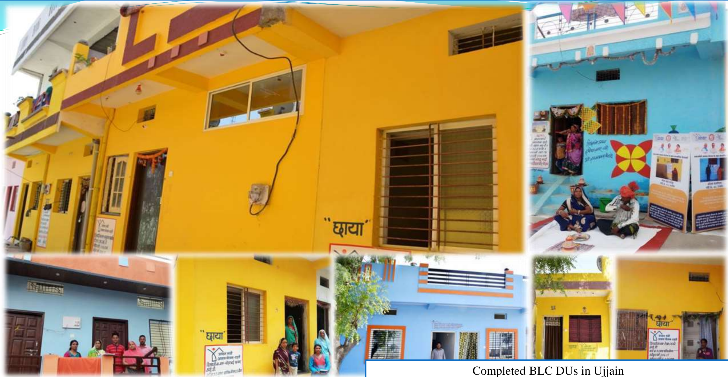
Completed BLC DUs in Ujjain