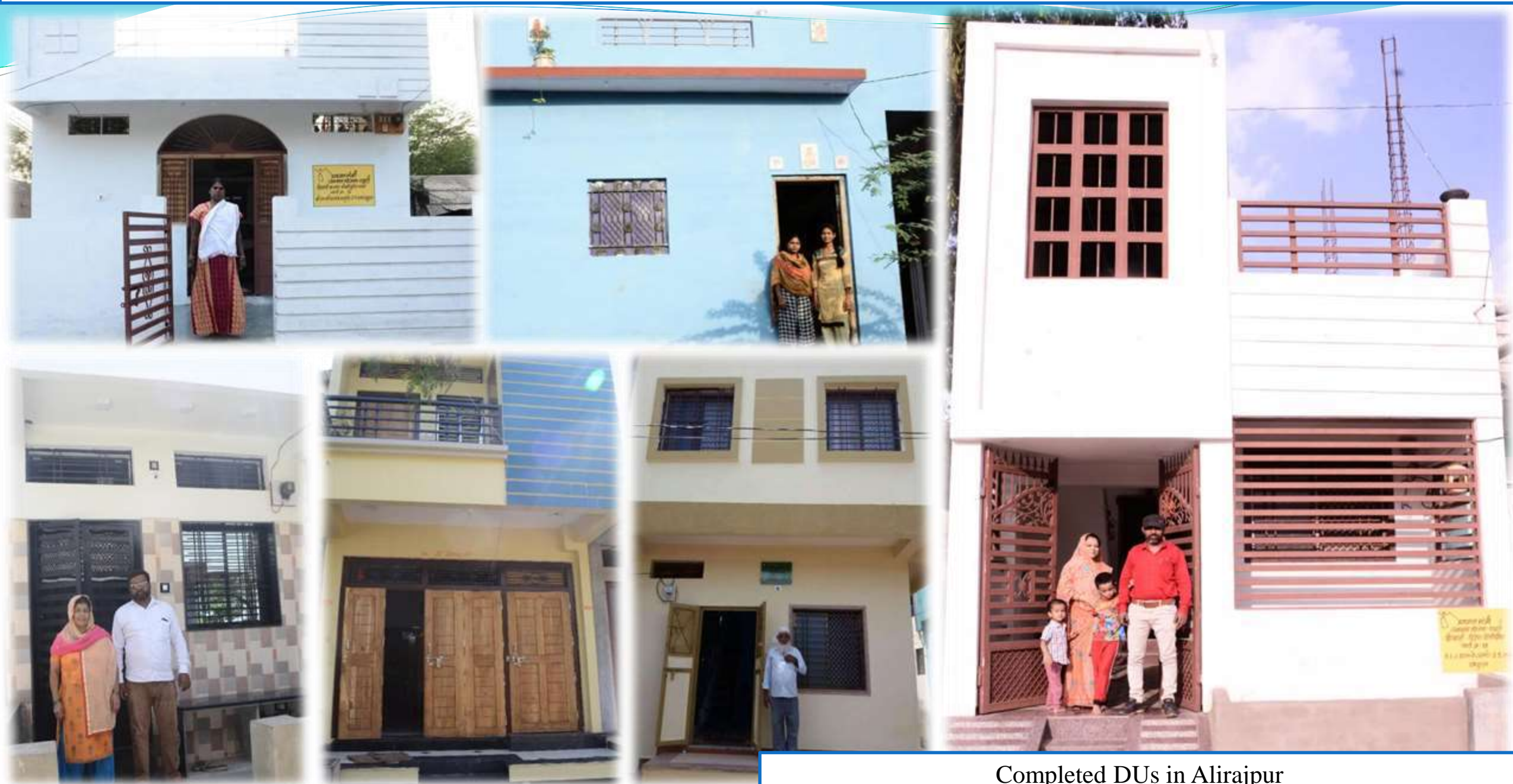
Completed DUs in Alirajpur