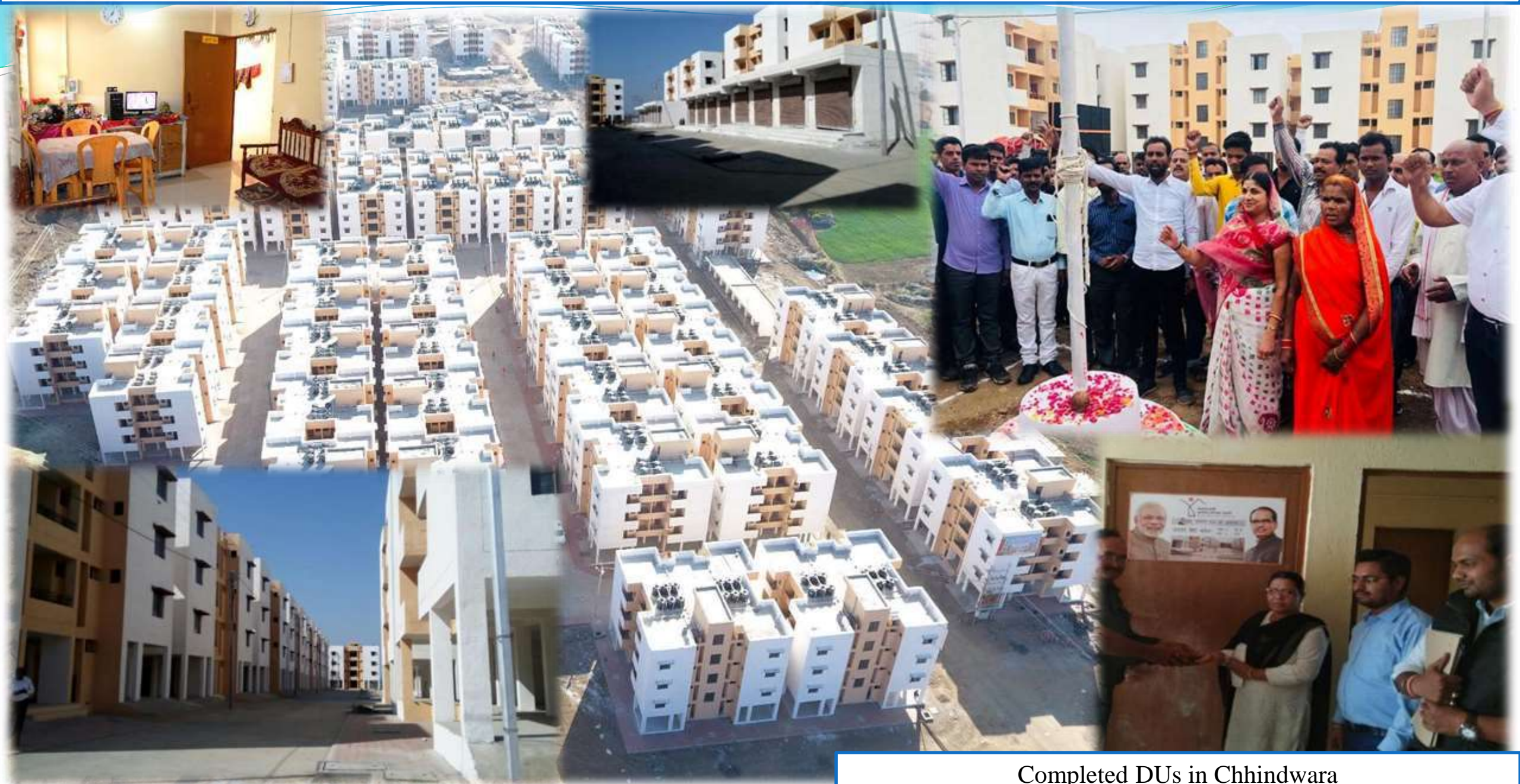
Completed DUs in Chhindwara