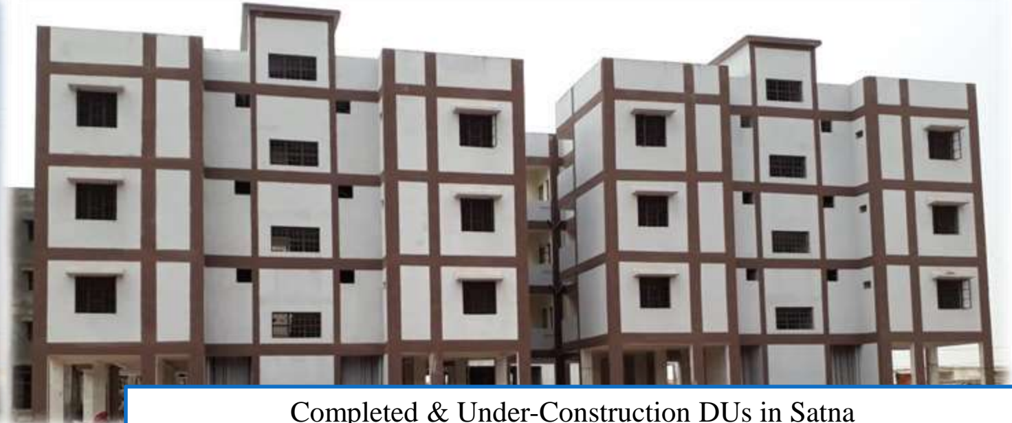
Completed & Under-Construction DUs in Satna