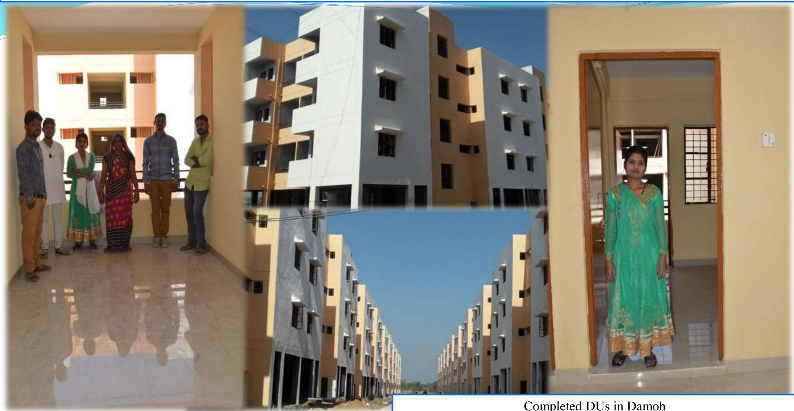
Completed DUs in Damoh