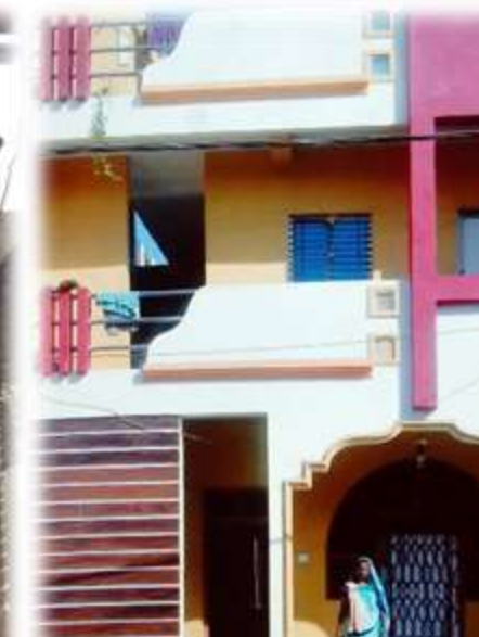
Completed BLC DUs in Sendhwa