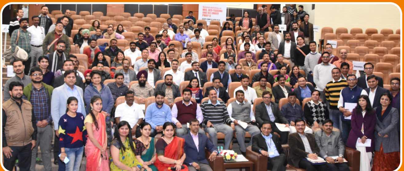
Group Photo Captured After the workshop