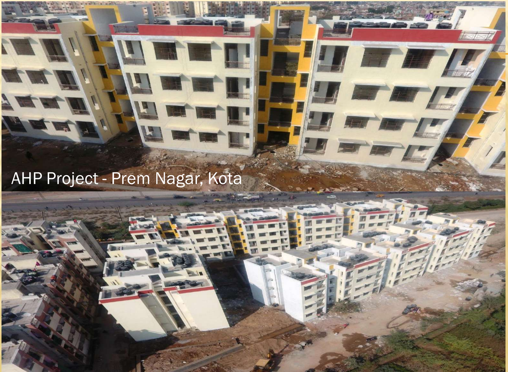
AHP Project - Prem Nagar, Kota