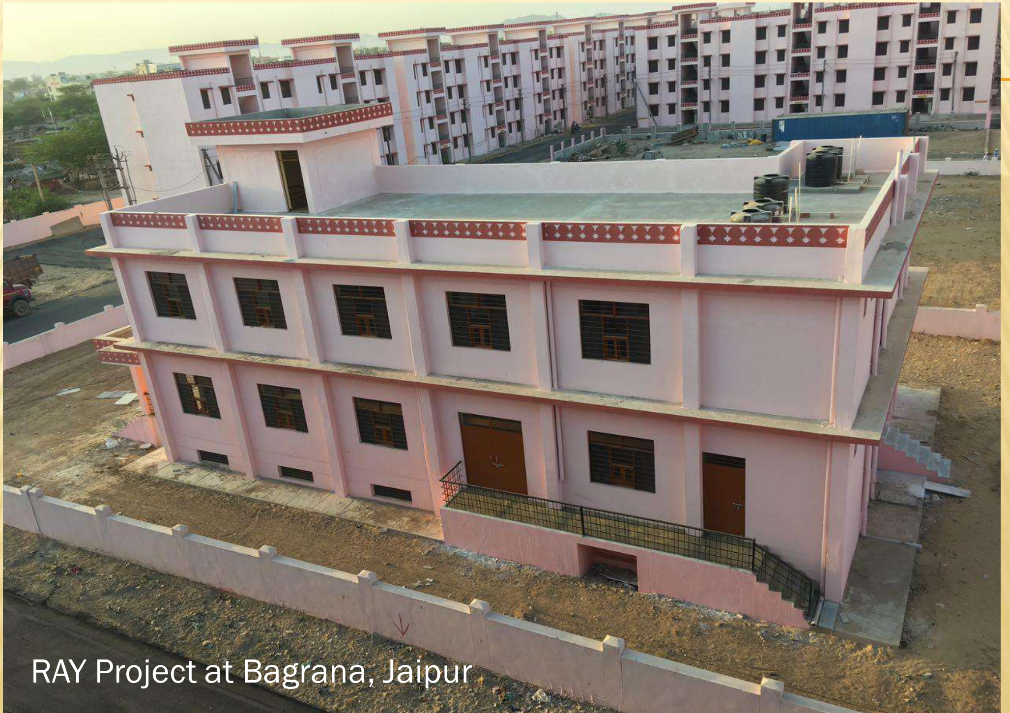
RAY Project at Bagraana, Jaipur