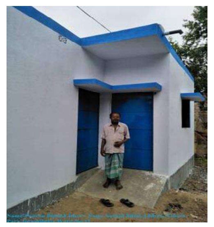
Suri Municipality, Birbhum District