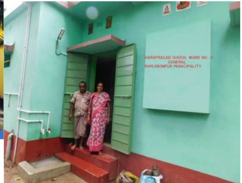
Ramjibanpore Municipality, Paschim Medinipur District