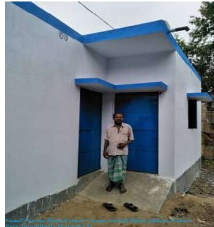
Suri Municipality, Birbhum District