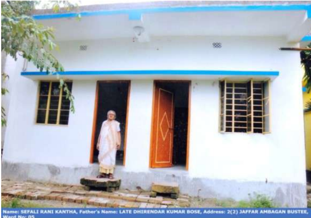
Barrackpore Municipality, North 24 Parganas District