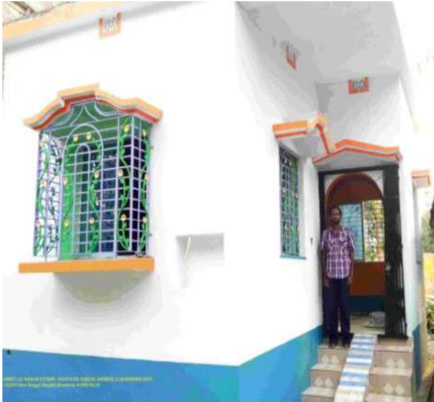
Bansberia Municipality, Hoogly District