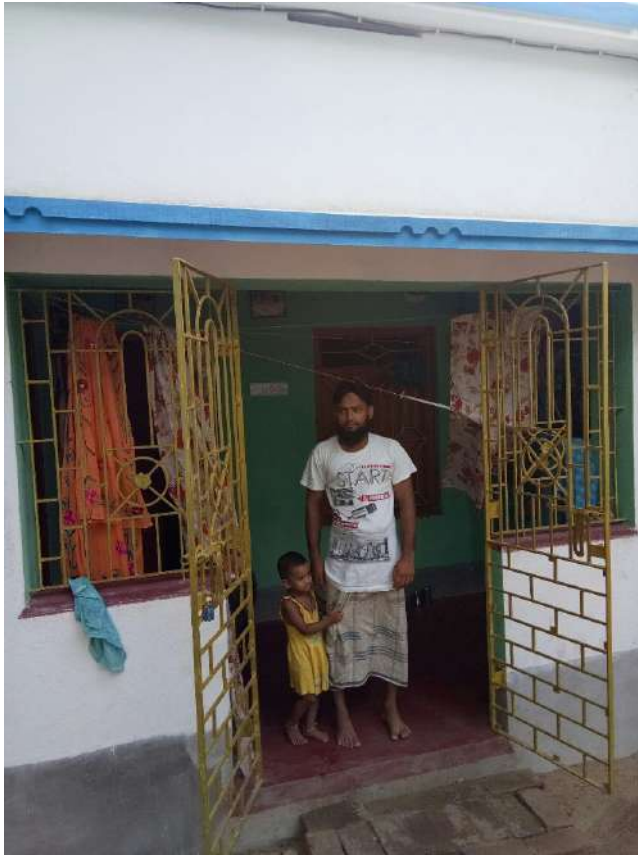
Contai Municipality, Purba Medinipur District