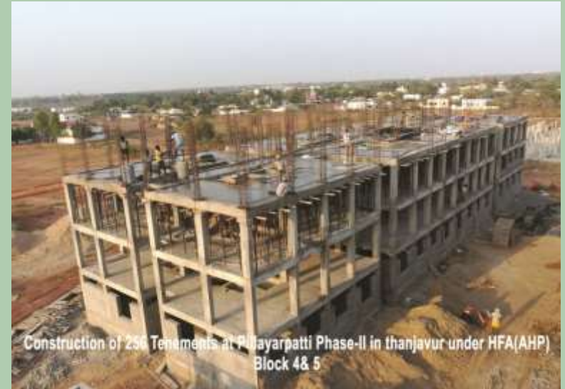
Construction of 256 Tenements at Pillayarpatti Phase-II in thanjavur under HFA(AHP) Block 4 & 5