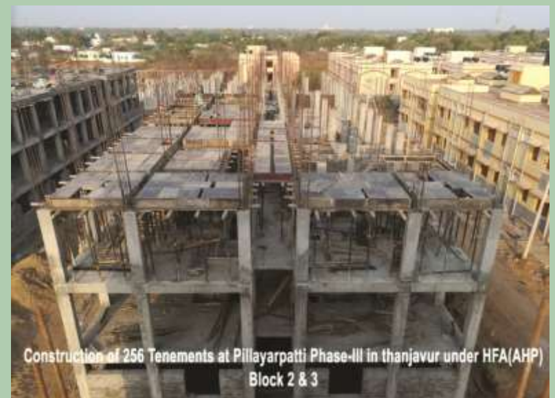
Construction of 256 Tenements at Pillayarpatti Phase-III in thanjavur under HFA(AHP) Block 2 & 3