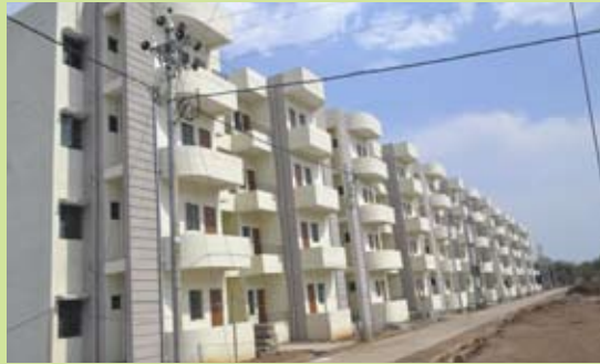
AHP under PMAY (U) in Pendri, Rajnandgaon, Chhattisgarh

A beneficiary will be eligible for availing only a single benefit under any of the existing options i.e. Slum Redevelopment with Private Partner, Credit Linked Subsidy, Direct Subsidy to Individual Beneficiary and Affordable Housing in Partnership. It will be the responsibility of States/UTs Government to ensure that the beneficiary is not given benefit under more than one component of the Mission.