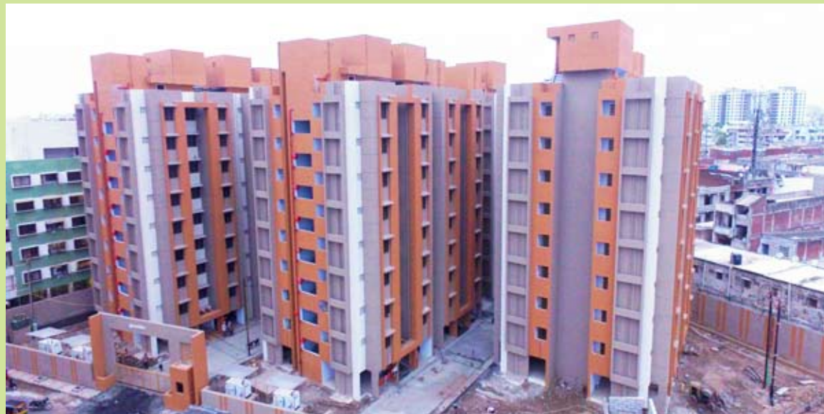
Houses constructed under AHP, Surat, Gujarat

A beneficiary will be eligible for availing only a single benefit under any of the existing options i.e. Slum Redevelopment with Private Partner, Credit Linked Subsidy, Direct Subsidy to Individual Beneficiary and Affordable Housing in Partnership. It will be the responsibility of States/UTs Government to ensure that the beneficiary is not given benefit under more than one component of the Mission.