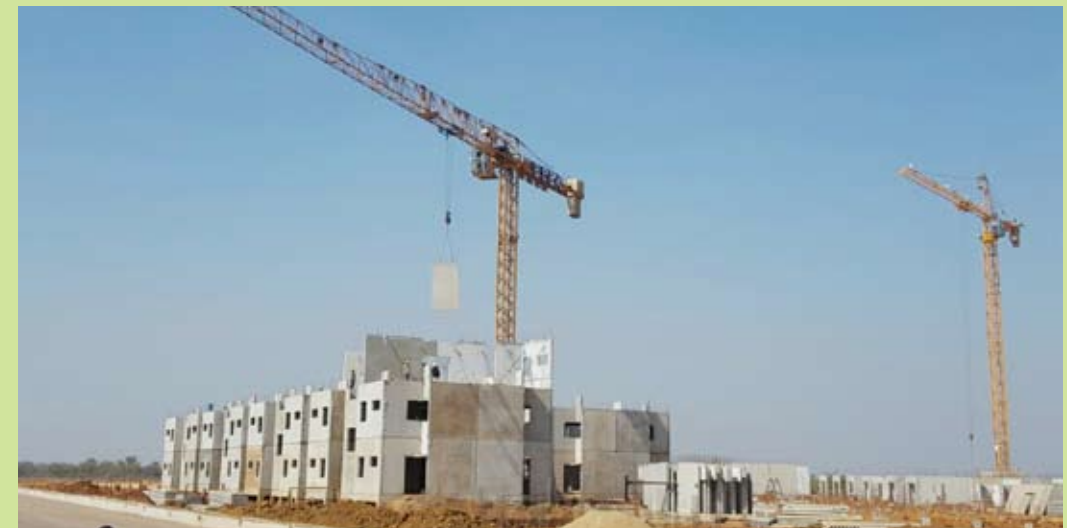
AHP under Construction Houses using pre-cast technology at naya Raipur, Chattisgarh