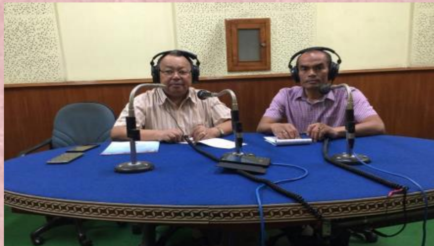
AIR Phone-in Prog on 25.08.2016