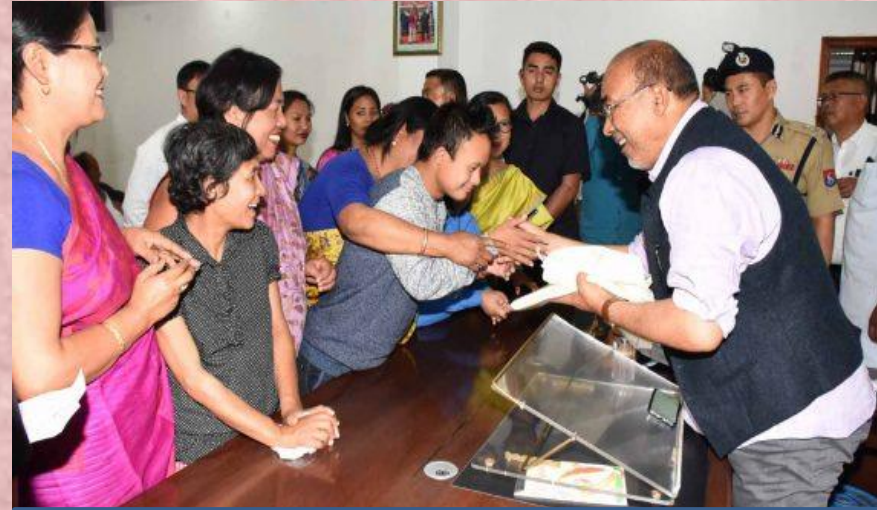
Hon'ble Chief Minister, Manipur, addressing the public grievances

“Meeyam gi Numit” (People's day) celebrated on 15 th of every month as a forum for the general public to address their grievances and submit their suggestions to the Hon'ble Chief Minister of Manipur