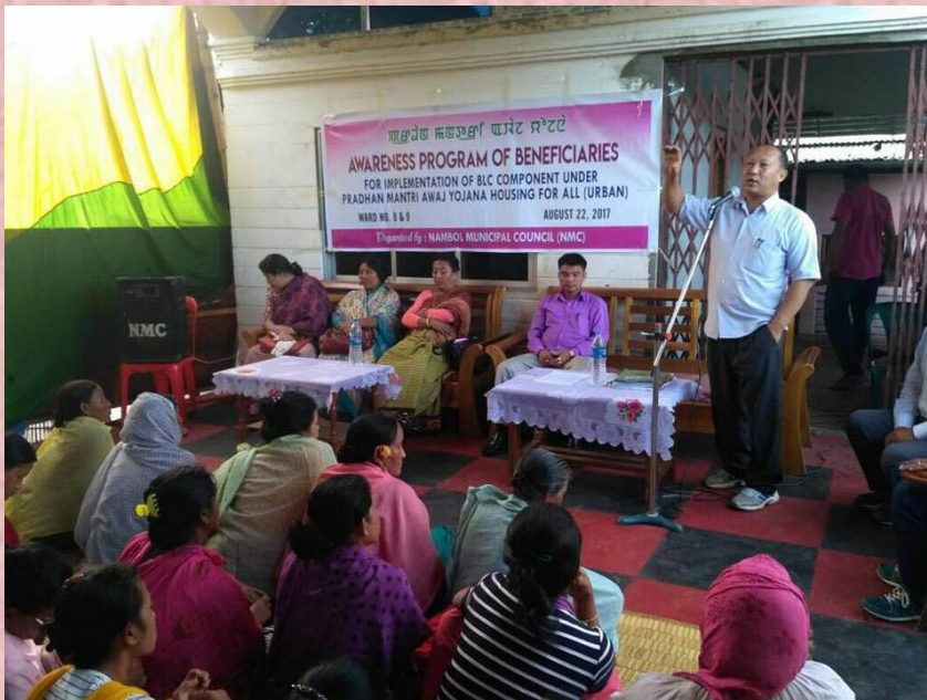
Mass Awareness Programme for Beneficiaries