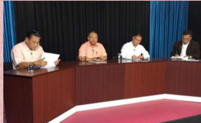
Panel Discussion on ISTV 08.08.2016