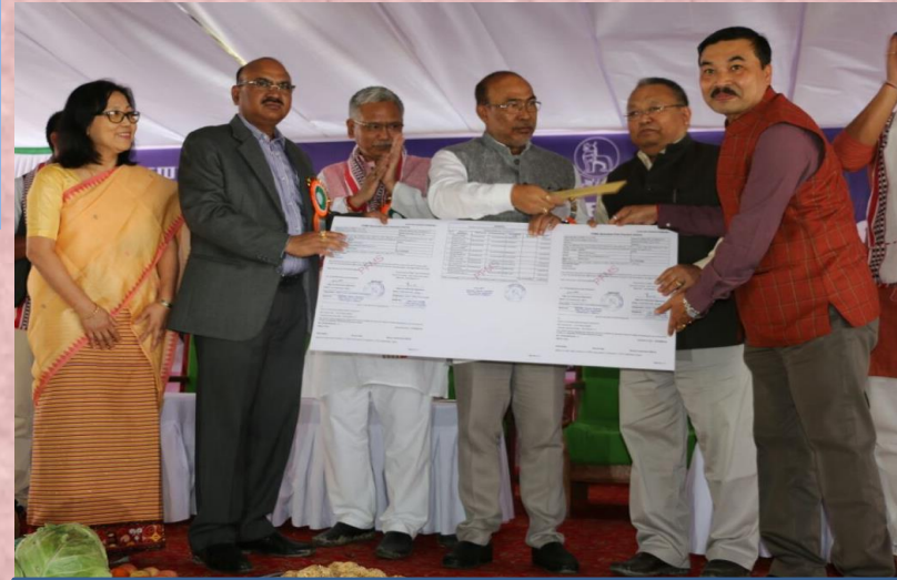
Hon'ble Chief Minister, Manipur, handing over Print Payment advice for DBT to beneficiaries

"Go To Village" is organised on every Tuesday to reach out to the citizens at their doorsteps, explaining government programmes and its benefits to the people and ensure timely delivery of services to eligible beneficiaries, redressal their problems and queries in a smooth and citizen-friendly manner and provides on the spot solutions without any delay.