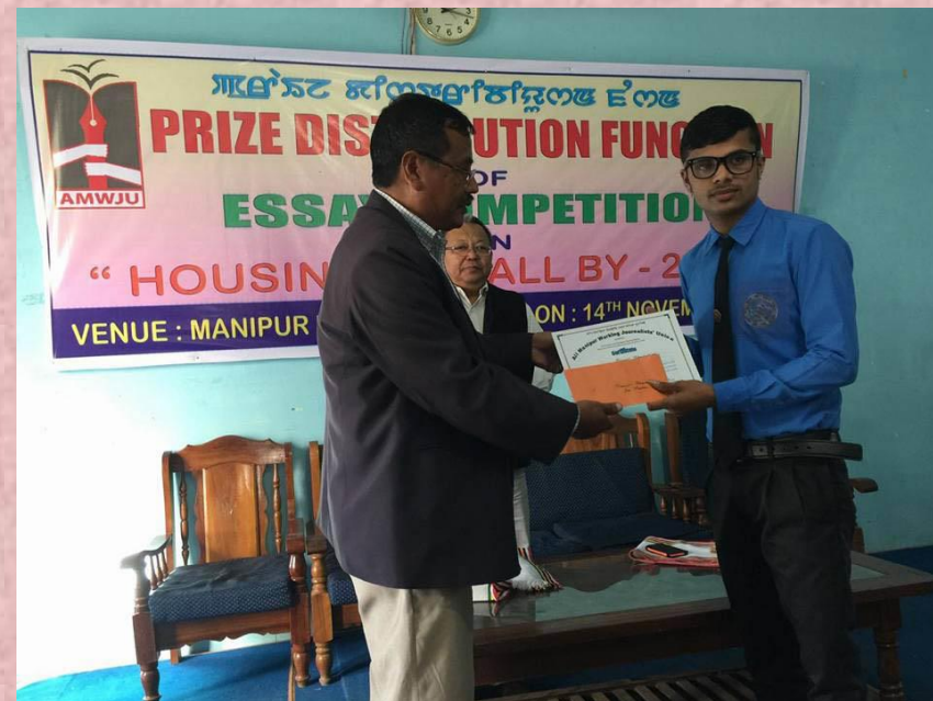
Prize Distribution for Essay Competition on HFA(U) by 2022