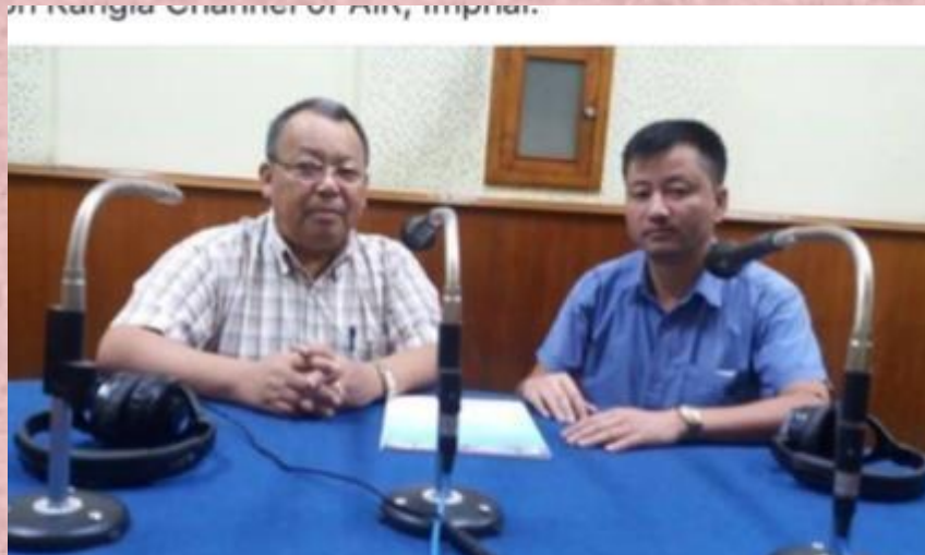
AIR Imphal Newsreel on 21.08.2016