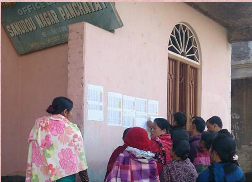
Applicants check their names at Preliminary List