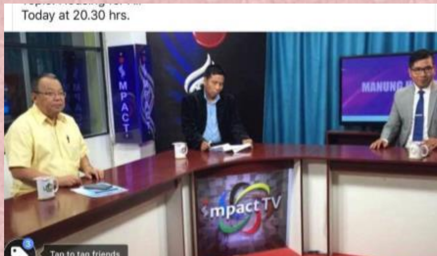
Panel Discussion on IMPACT TV