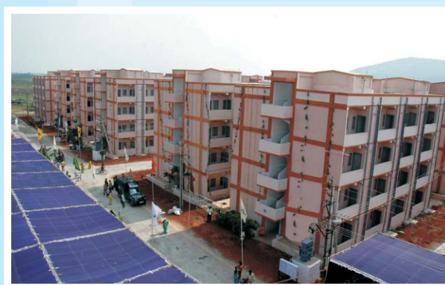
"Houses built under slum upgradation programmes in India"