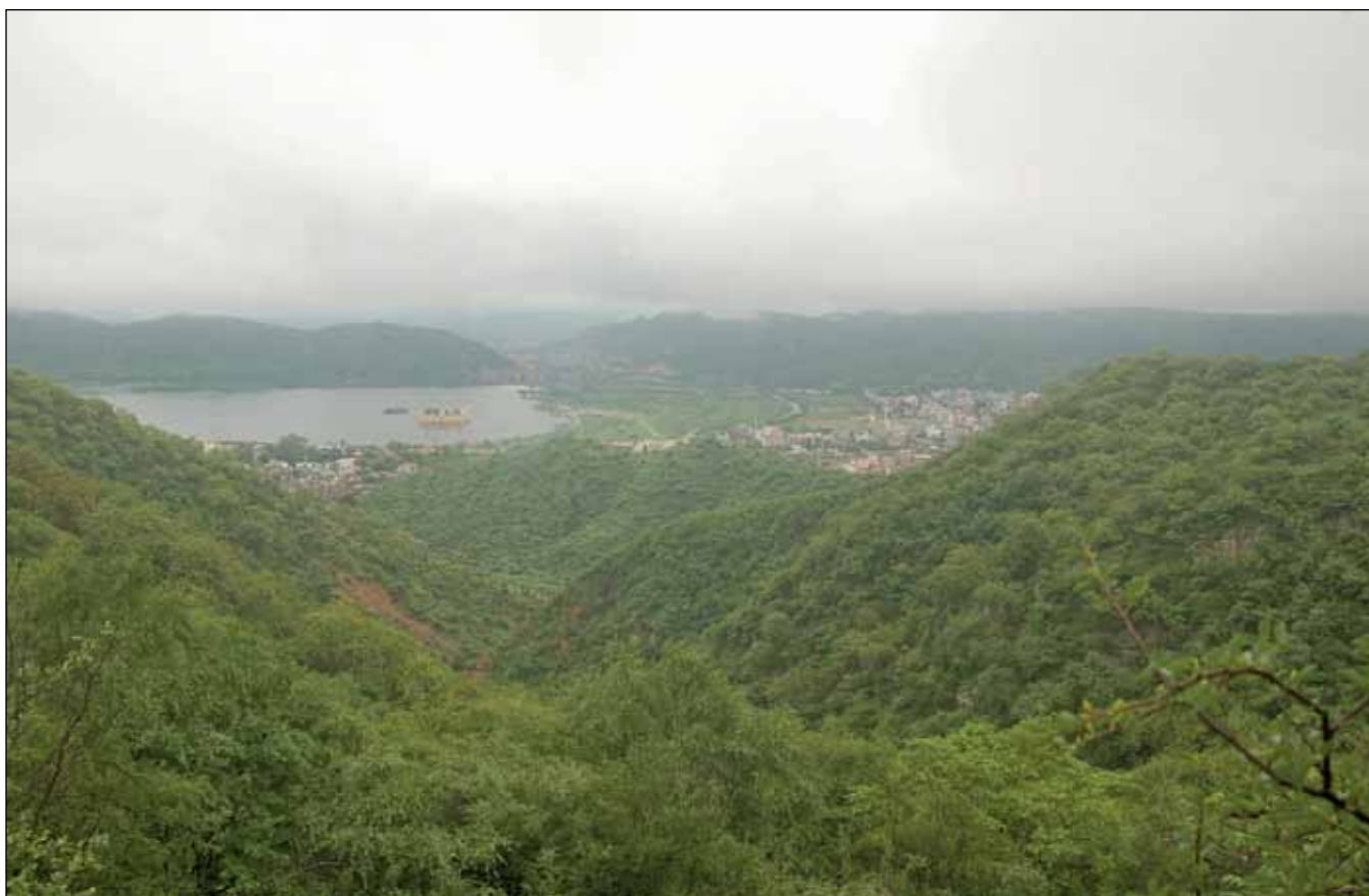
Jaipur's Man Sagar lake.