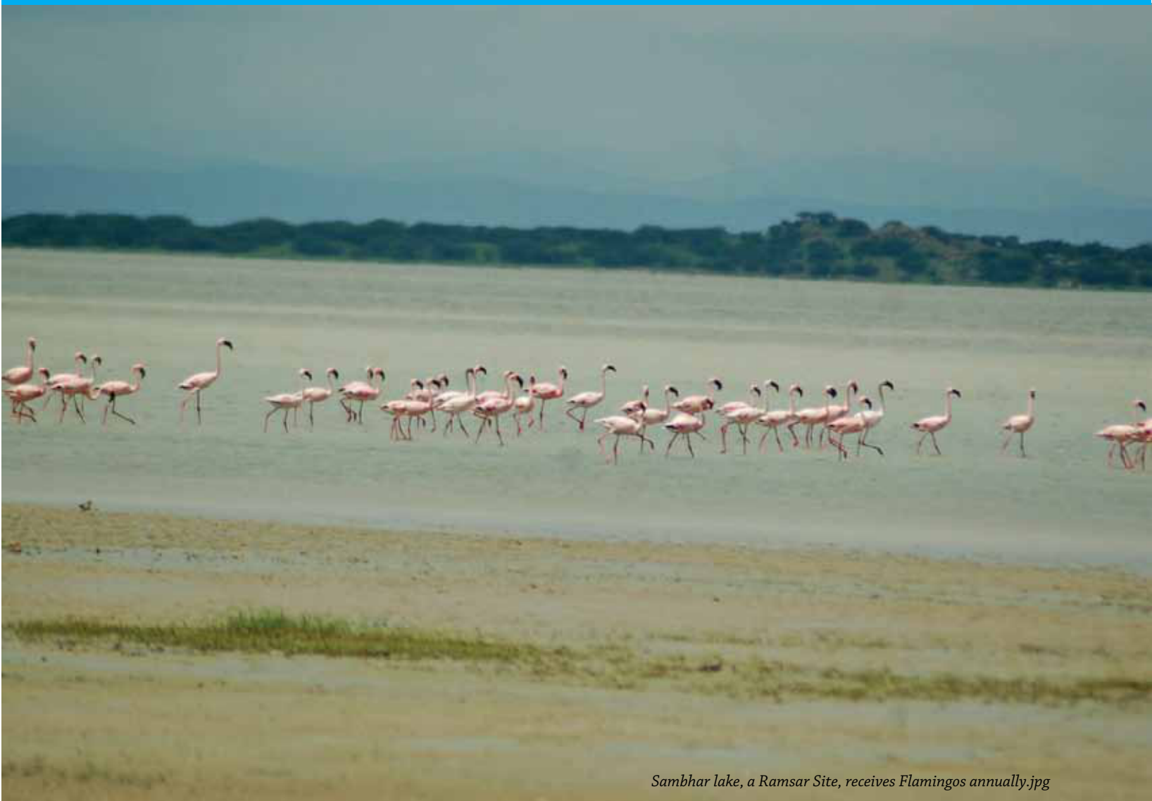
Sambhar lake, a Ramsar Site, receives Flamingos annually.jpg

Ministry of Urban Development Government of India http://moud.gov.in