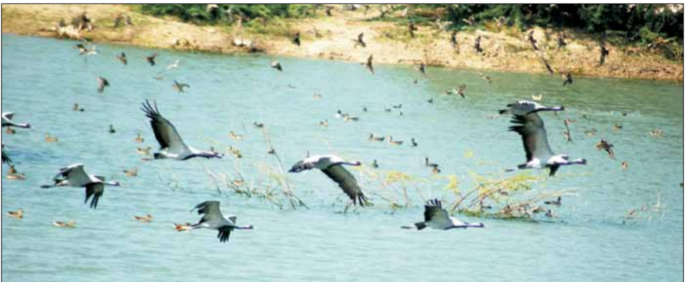
Demoiselle Cranes and ducks at a wetland.