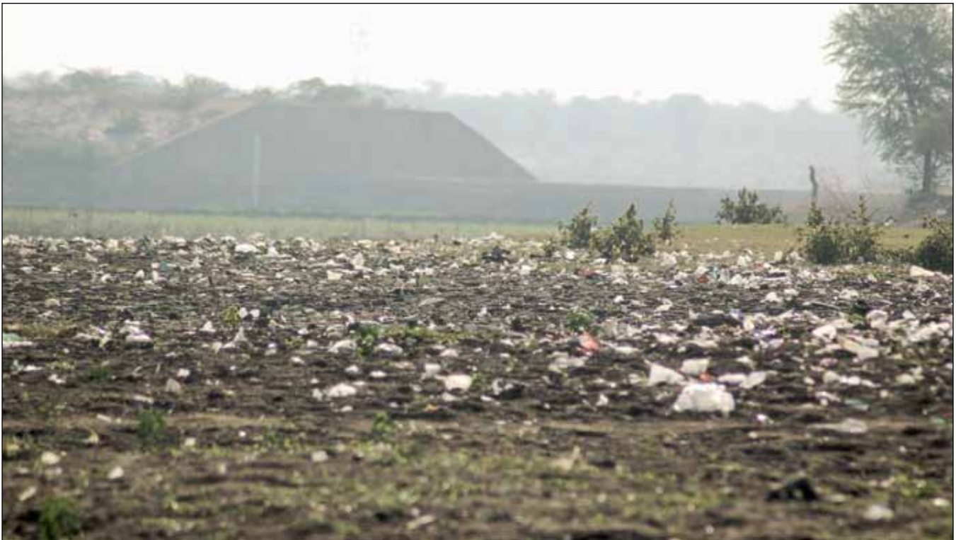
Ramchandrapura Lake now extinct (south of Jaipur).

A city of about 3 million population is estimated to produce nearly 10 crore litres of waste water daily which can be re-cycled and re-used, to amply meet the local/non-potable needs.