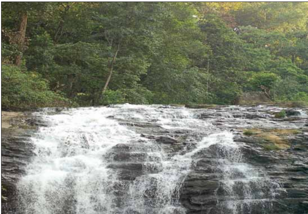
Water-shed of a lake in the Western Ghats.

The Cabinet Committee on Economic Affairs (CCEA) in its meeting held on 7th February, 2013, has approved the proposal for merger of National Lake Conservation Plan and National Wetlands Conservation Programme into a new scheme 'National Plan for Conservation of Aquatic Ecosystems' (NPCA). The merged scheme is to be operational during XII Plan Period at an estimated cost of Rs.900 crore and shall have a funding pattern of 70:30 cost sharing between Central Government and respective State Governments (90:10 for NE States).