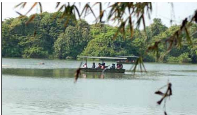
Recreation helps appreciate lakes' qualities.

31. Most Lakes receive storm-water during monsoon season to meet annual requirement of water in their bed; the first flush brings in incalculable organic load and silt in to the lake, which are most hazardous and alter their water chemistry beyond easy solutions. Such storm water loads must be arrested prior to entry points by using bio-approach like creation of a 'sedimentation basin' at space prior to entry-point, or at the entry-point or around.