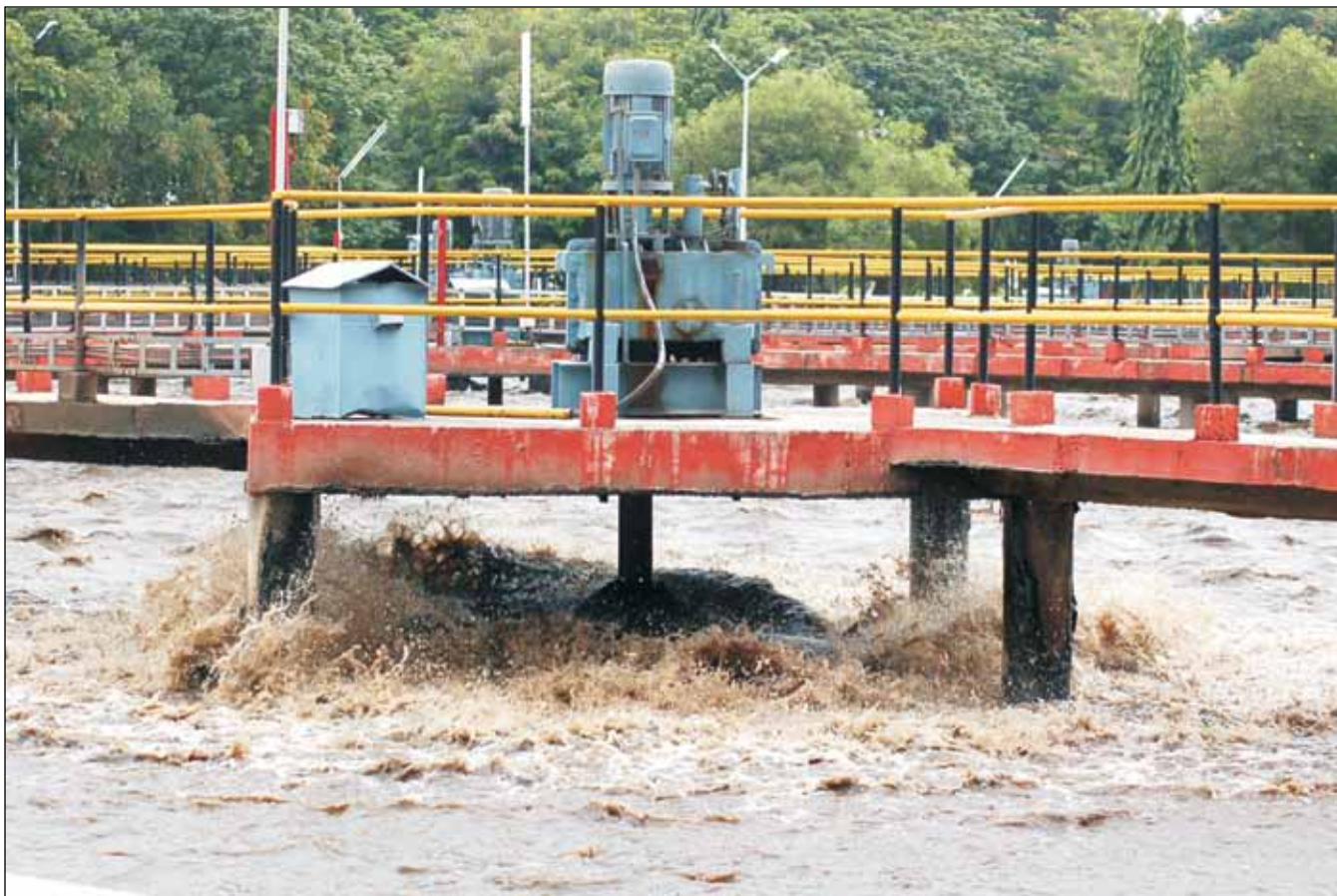
A treatment plant based on chemical-uses.

6. Measures like cleaning of Water Body involving de-silting, de-weeding, aeration, reduction of nutrient, removal of floating and other invasive aquatic plant-species or any successfully tested and technologically suitable to the local condition, may be taken up.