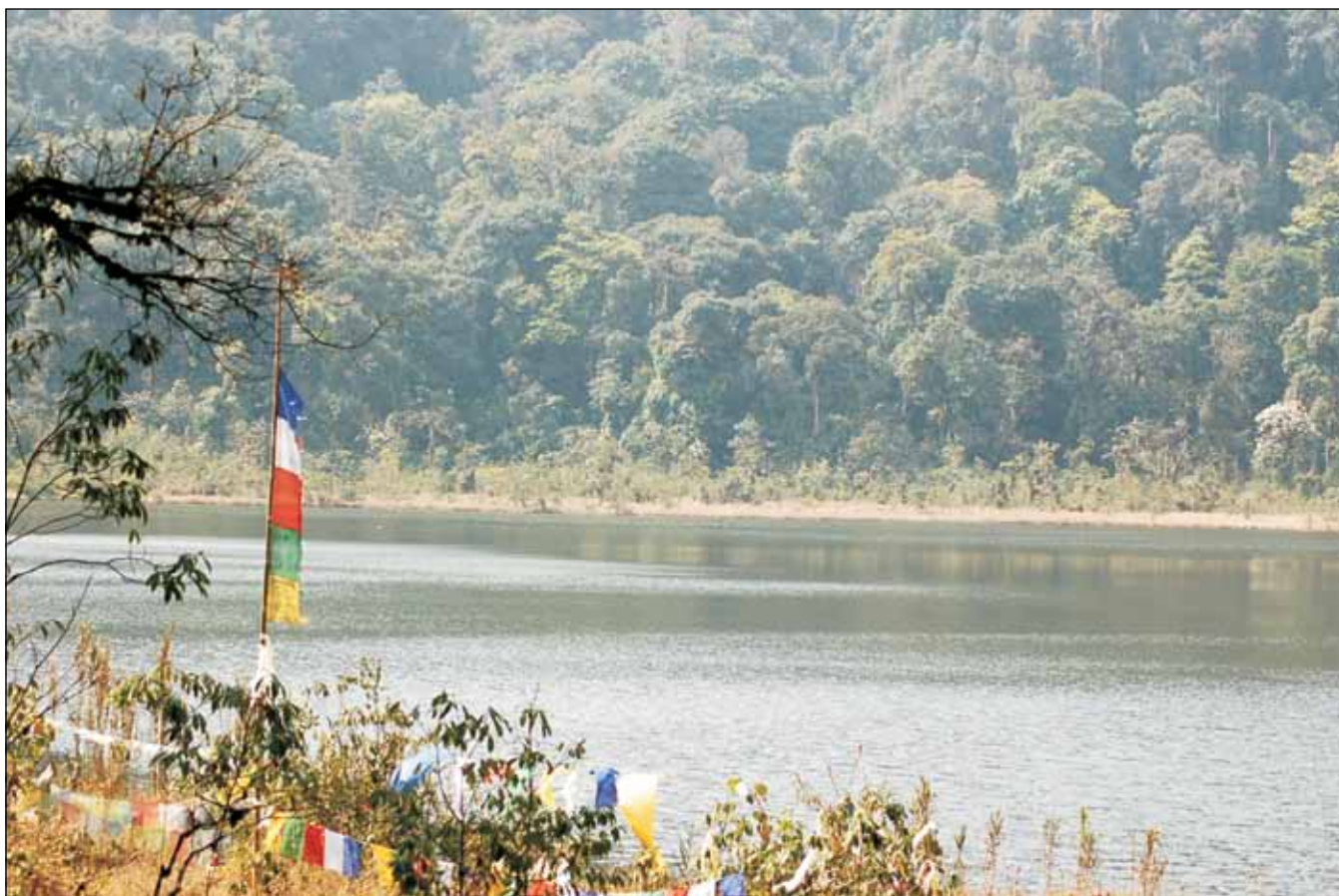
Khecheperi lake in Sikkim, a holy example.

to enable it to become self-reliant in demand-supply of this natural resource.