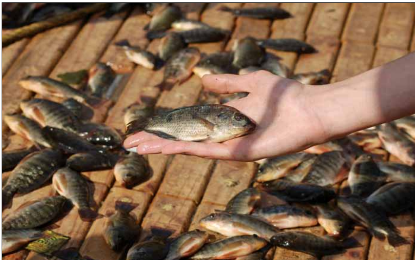
Invasive fish species adversely impact lakes' ecology.