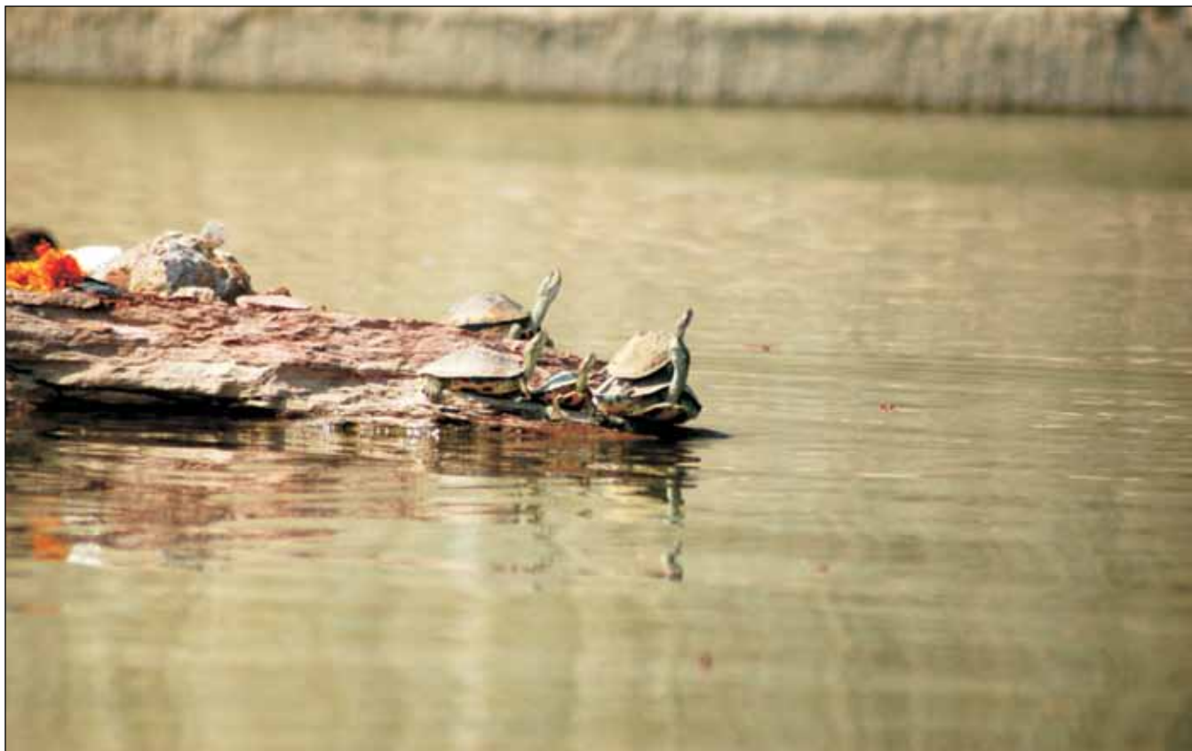
Tortoises contribute to water quality.

26. It should be ensured that each urban complex develops its Water Plan and Water Budget (for drinking, other domestic uses, industrial uses and for all remaining uses like gardening, etc.)