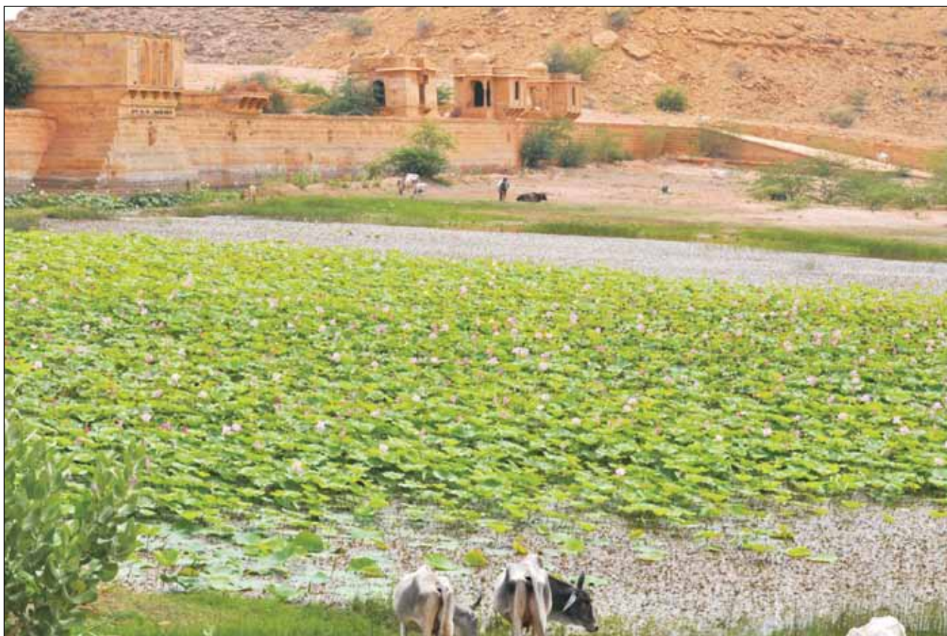
A mozaic of aquatic vegetation at Jaisalmer's Gajrup Sagar lake.

20. Alternate sources of funds for lakes will be welcome. However, the adoption of PPP as an appropriate mechanism is to be so developed that the natural resources, like lakes/ponds, are not handed over, for ever, and in to to, into hands of private partners. A tripartite arrangement can be firmed up between (a) funding agency (private company or any other sources), (b) the government agency (city or State authority) and (c) implementing agency (a public trust