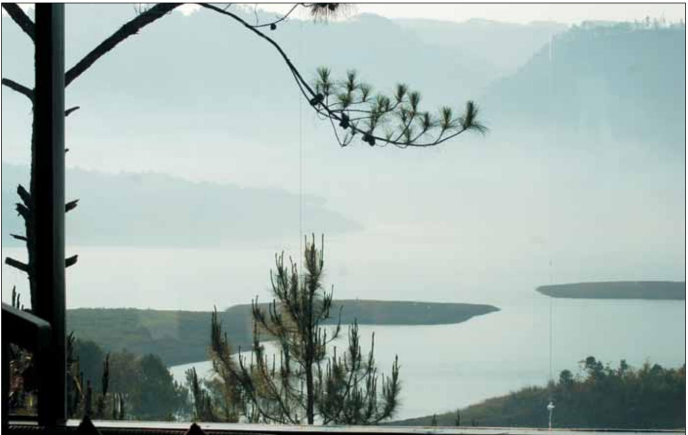
Shillong lake, an example in just use and intact watershed.

The visual quality of the communities built around the lake is highly dependent on the condition of the Water Body and the lake-shore. The natural beauty of the lake is part of the quality of life for lake-shore property owners and the entire community. The quality of a lake directly affects community property values and, therefore, the local tax base. A properly managed lake provides recreational opportunities for citizens and mode of revenue for the Government for maintaining