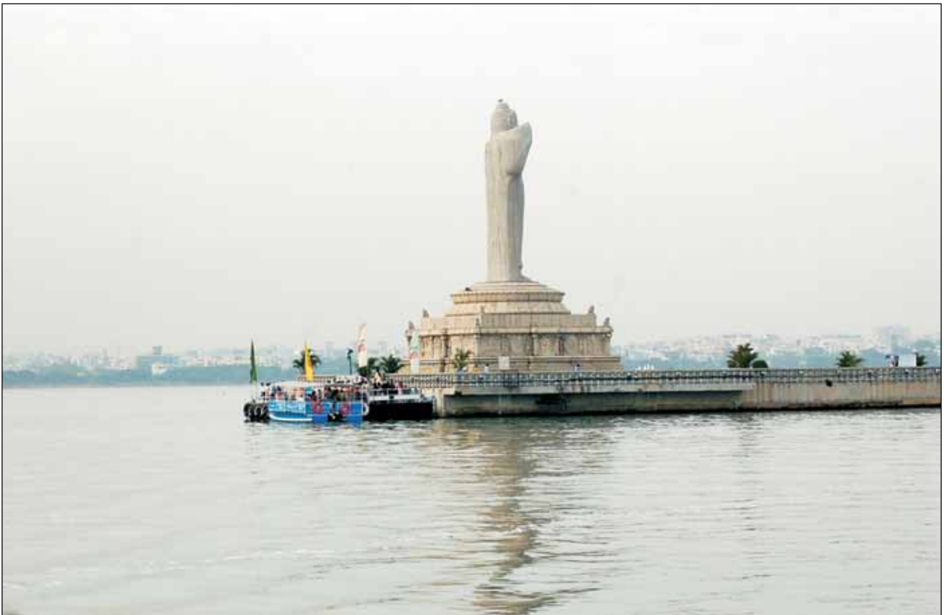
Hyderabad lake is receiving some restoration initiatives.

The landscape of India is dotted with large number of lakes, reservoirs and wetlands. Historically, the lakes have met water demands of the population for centuries and a community management system had sustained them for a long period of time.