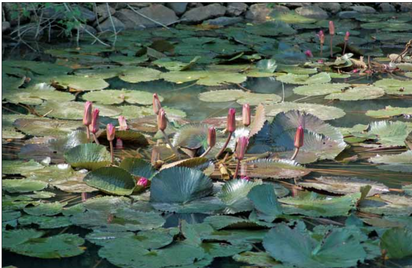
Such broad-leaved aquatic vegetation is catalyst to lake-restoration.

land slides only in case of Special Category States where such problems are common and