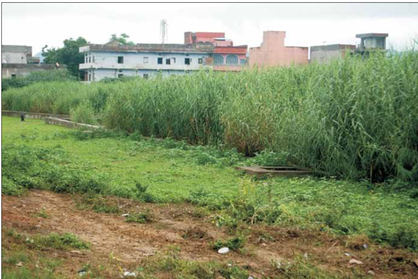
Reeds at a Constructed Wetland, the bio-treatment technique.

12. Any commercial use of the lake and its immediate surrounding areas should be properly assessed before conveying the permission.