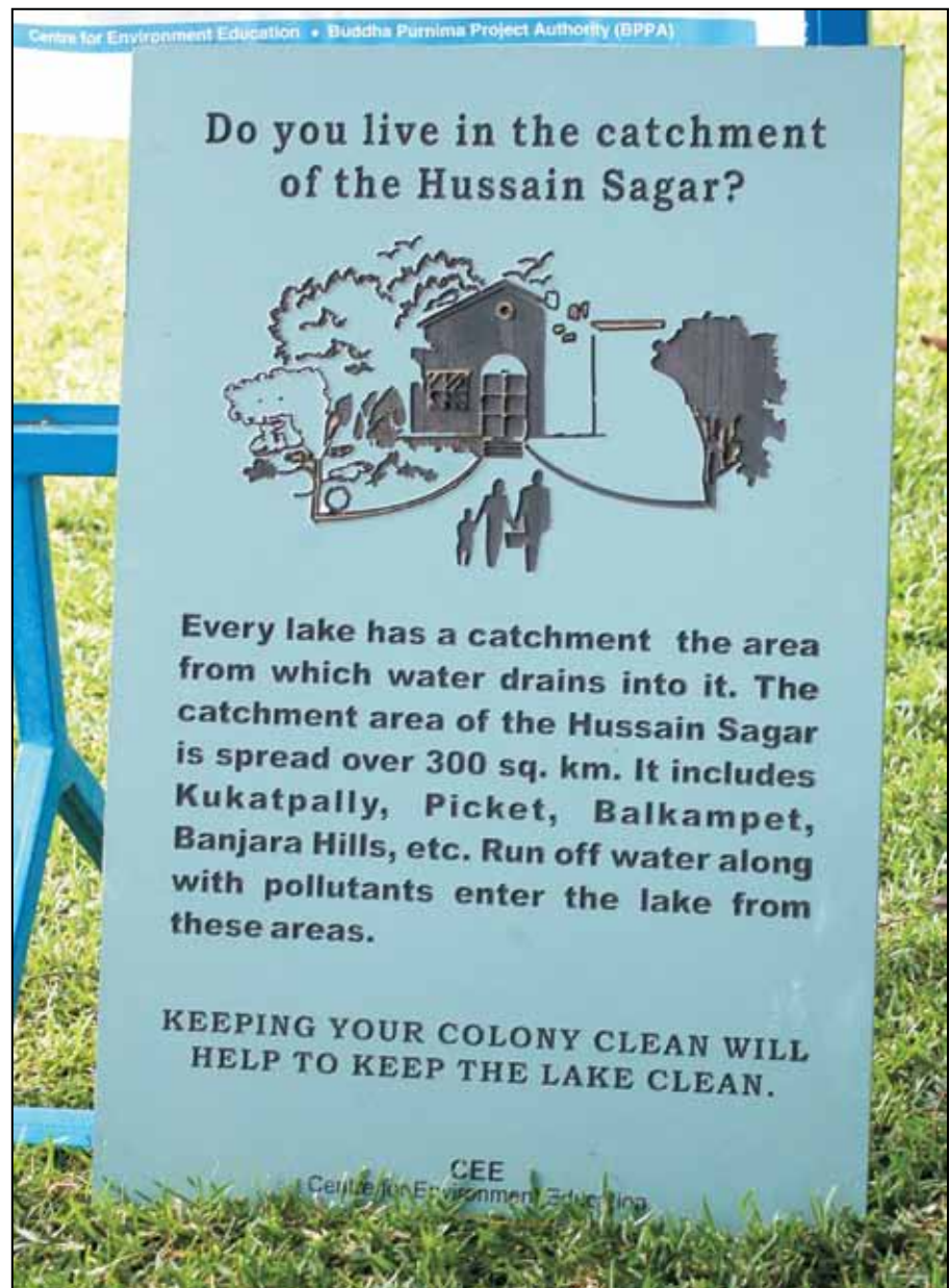
A lake awareness example at Hyderabad.

sites of artistic, religious and spiritual pursuits. These are essentially relevant social benefits. Therefore, the need to initiate efforts to restore, conserve, manage and maintain the lakes as an inseparable part of the whole eco system cannot be undermined.