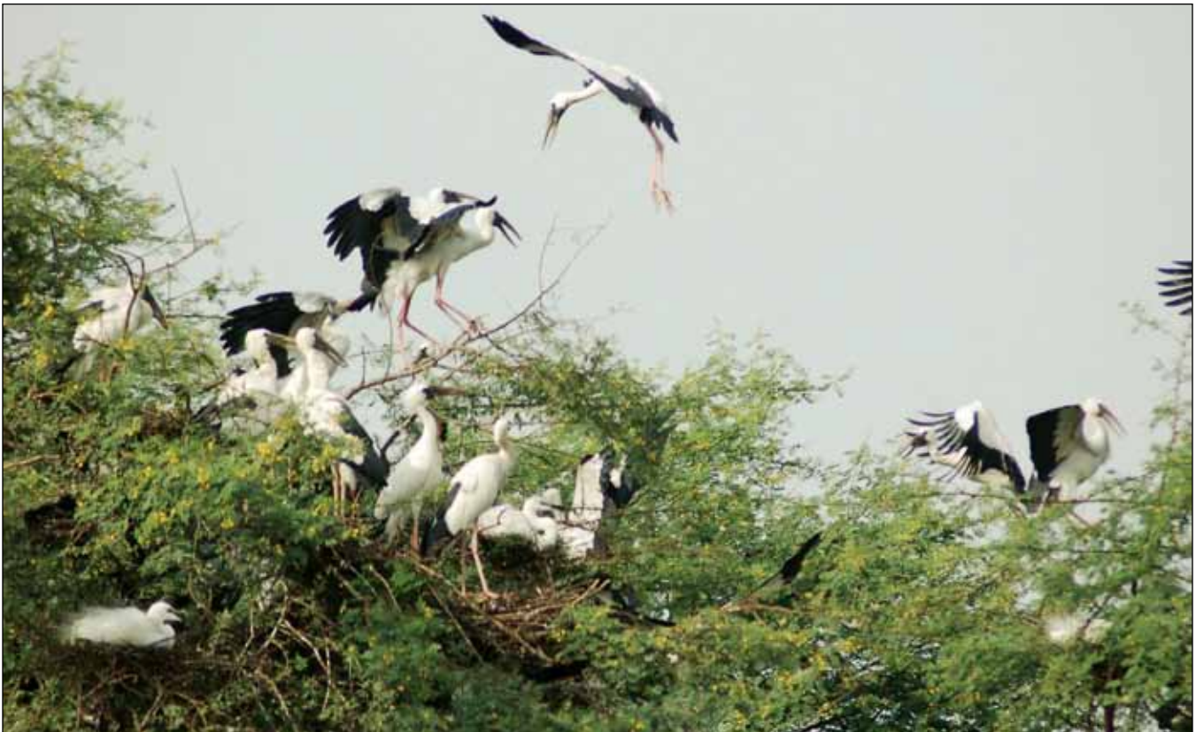
Heronries signify lake's qualities.

Government of India operationalized wetland conservation programme in 1985-86 in close collaboration with concerned State Governments. During 10th Plan 94 wetlands, 39 mangrove ecosystems, 4 coral reefs were identified for management and conservation.