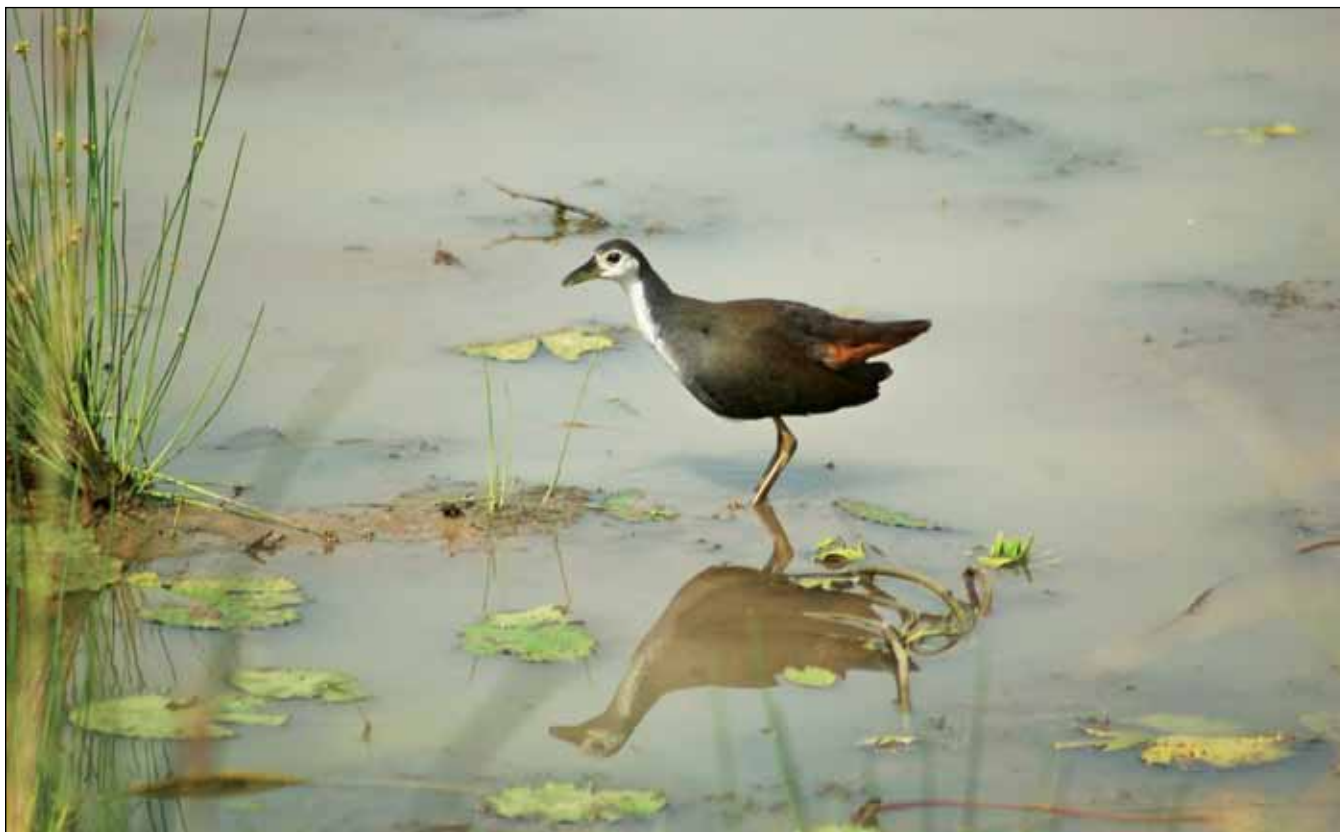
Pollution of Lake due to urban waste water at a central Indian Lake.