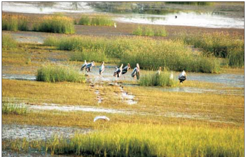
A mix of aquatic vegetation, fish and avifauna at Kharda lake in Pali district.