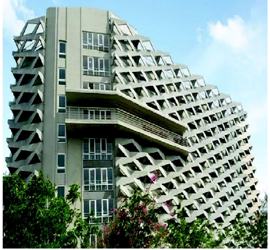
Screening of Utilities

The Commission has prepared guidelines on significant aspects of Cityscape which would complement the development of Smart cities and are expected to enhance the environmental quality, aesthetics of not only the Capital City but could be adopted by the other metropolitan cities in the Country. Some of the significant completed and ongoing guidelines are enumerated below.