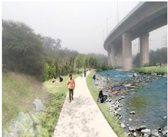
24.78 City Level Urban Design Guidelines