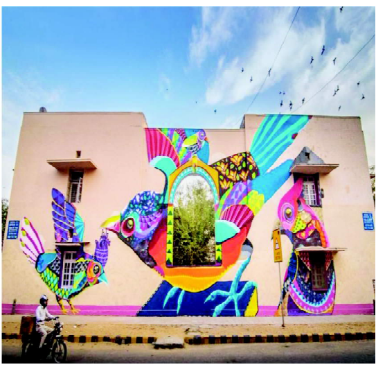
Art in Public Places