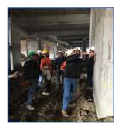
(B) Chennai Phase - III Projects