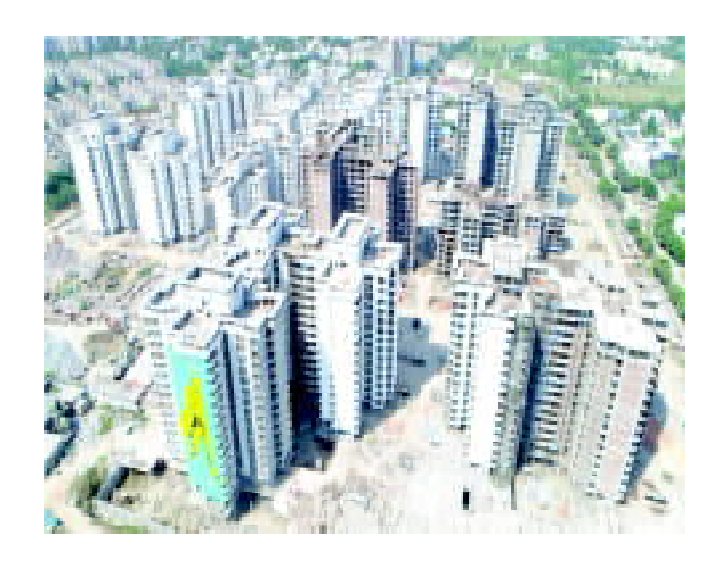
Quality Assurance by IIT Roorkee