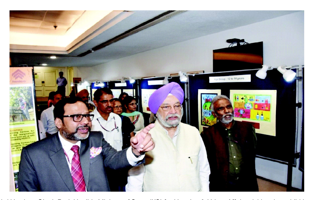
Shri Hardeep Singh Puri, Hon'ble Minister of State (I/C) for Housing & Urban Affairs visiting the exhibition of Prize-winning entries of the Painting Competition of Differently Abled Children organised by BMTPC during the World Habitat Day on October 4, 2019 at New Delhi