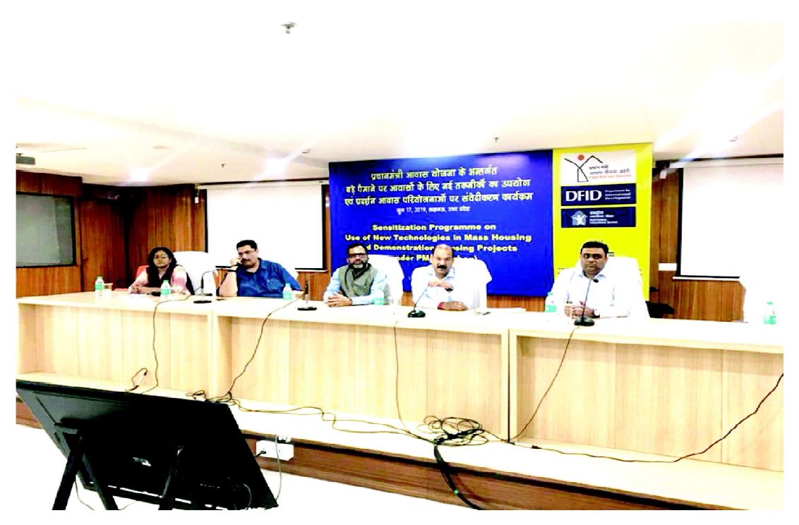
Sensitization Programme on "Use of New Technologies in Mass housing" under PMAY (Urban) on 17 June 2019 at Lucknow