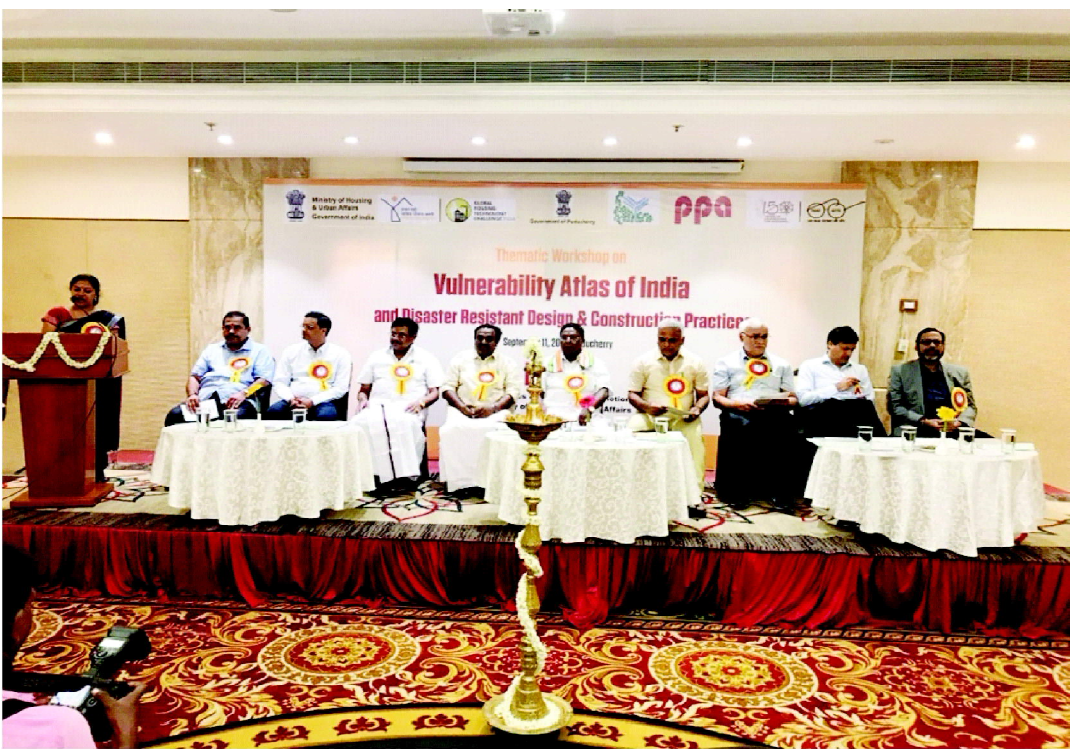
Thematic Workshop on Vulnerability Atlas of India and Disaster Resistant Design & Construction Practices organized on 11th September, 2019 at Puducherry