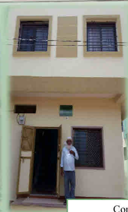
Completed and Under-Construction DUs in Alirajpur