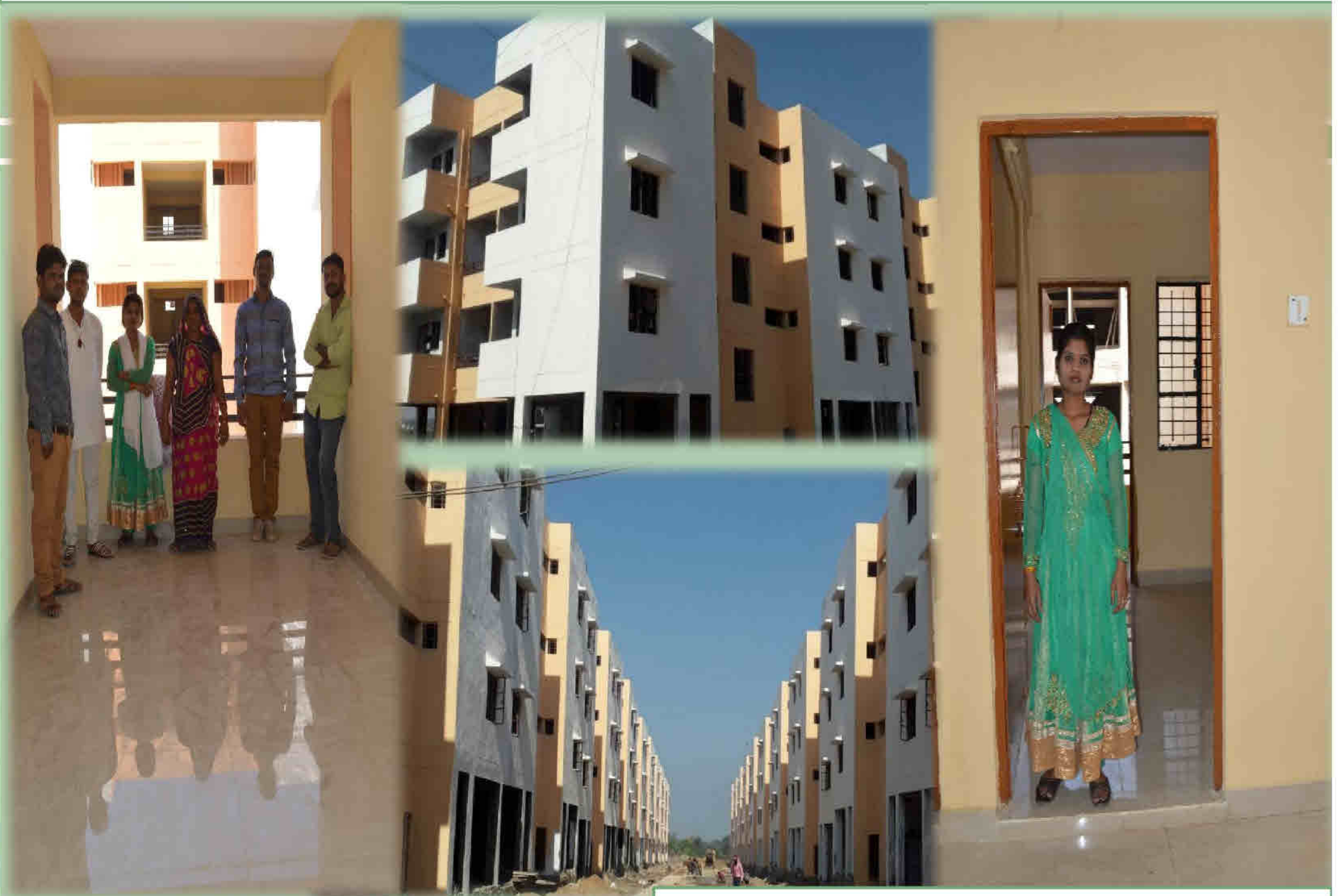
Completed DUs in Damoh