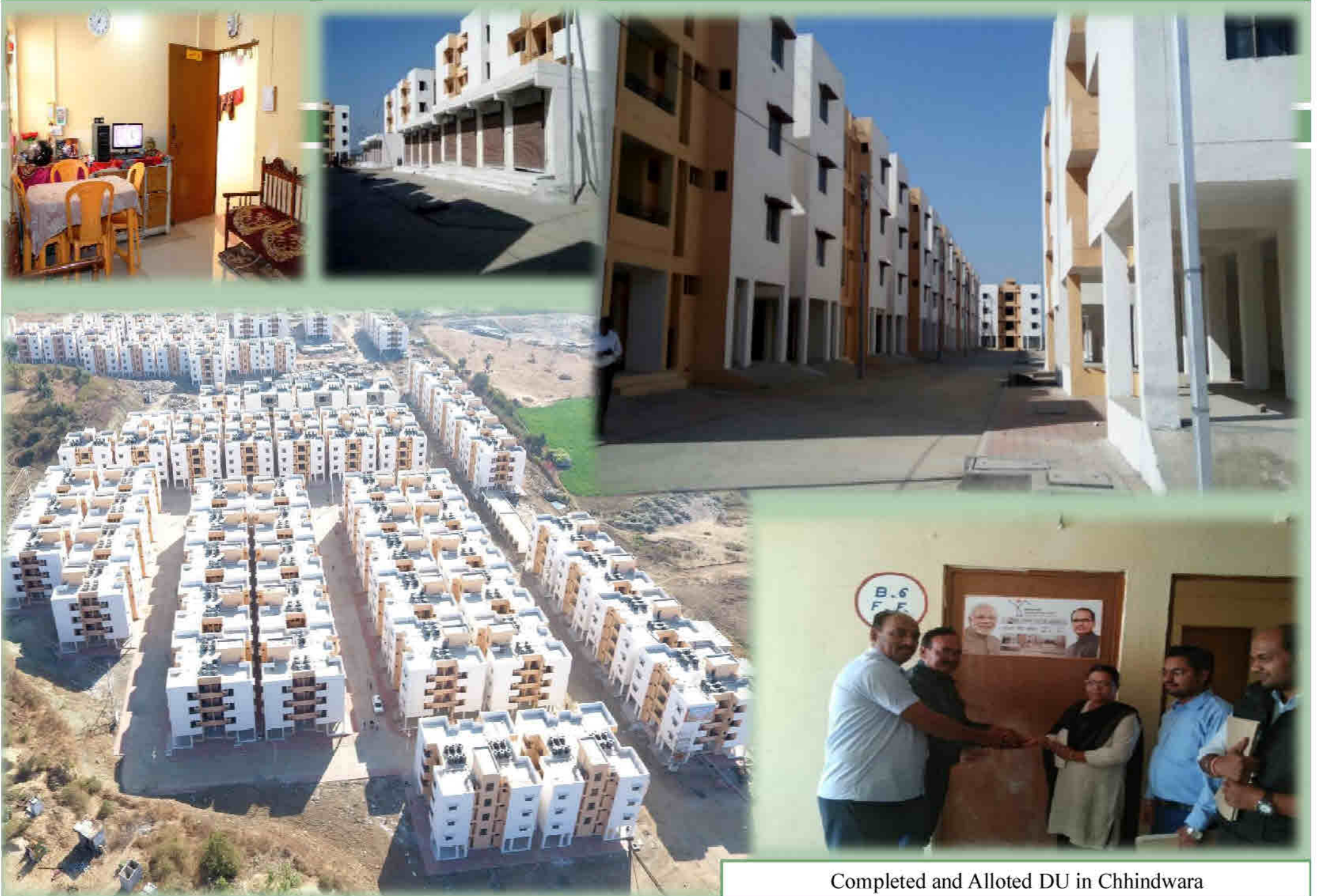
Completed and Alloted DU in Chhindwara