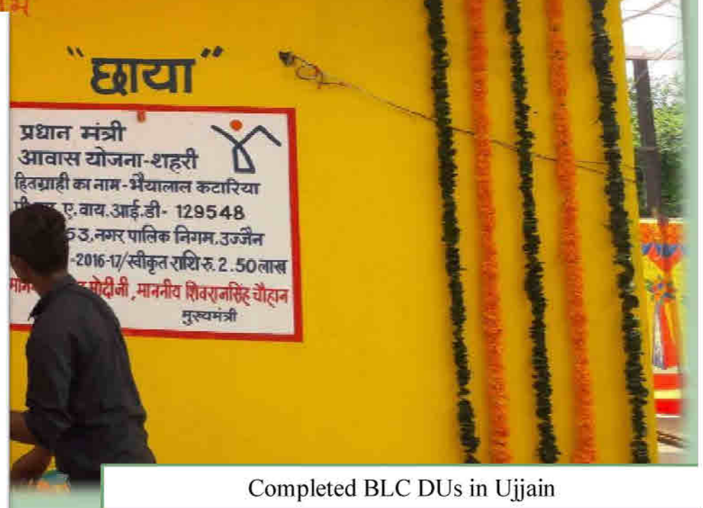
Completed BLC DUs in Ujjain