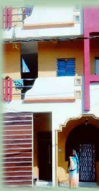
Completed BLC DUs in Sendhwa