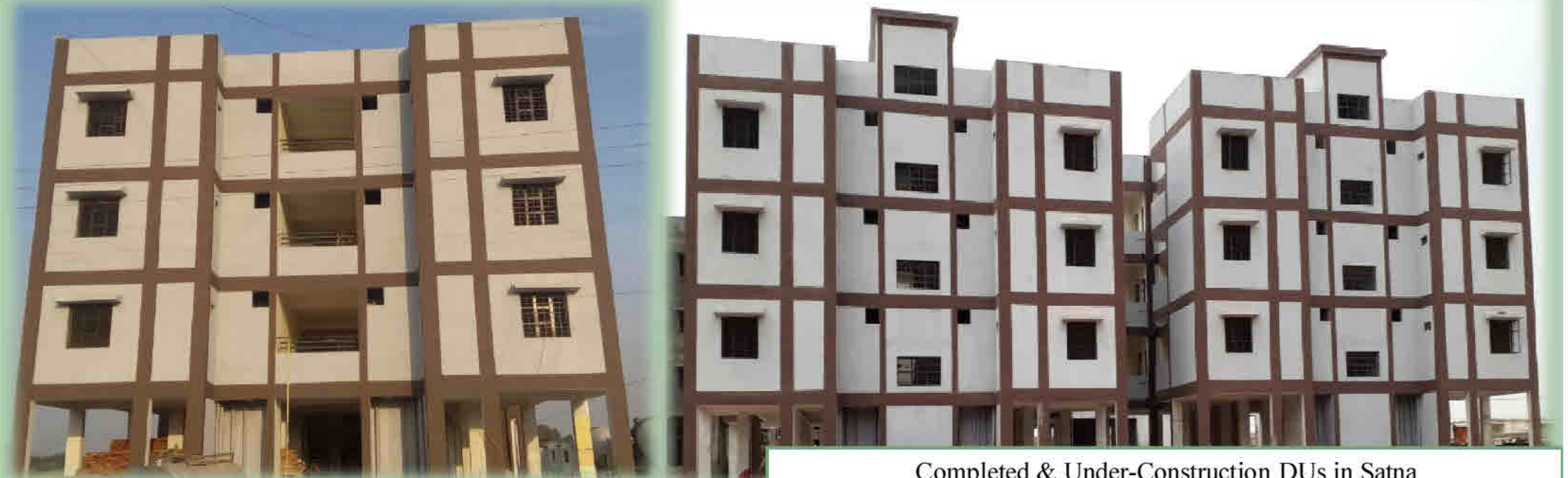
Completed & Under-Construction DUs in Satna