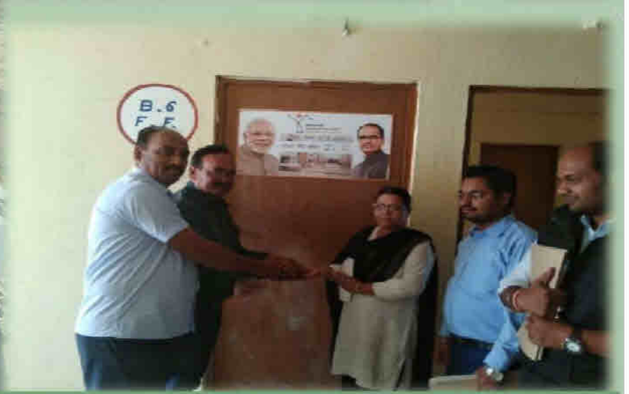
Completed and Alloted DUs of Chhindwara