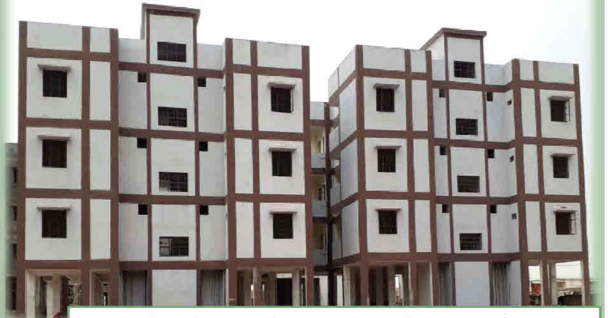
Completed & Under-Construction DUs in Satna