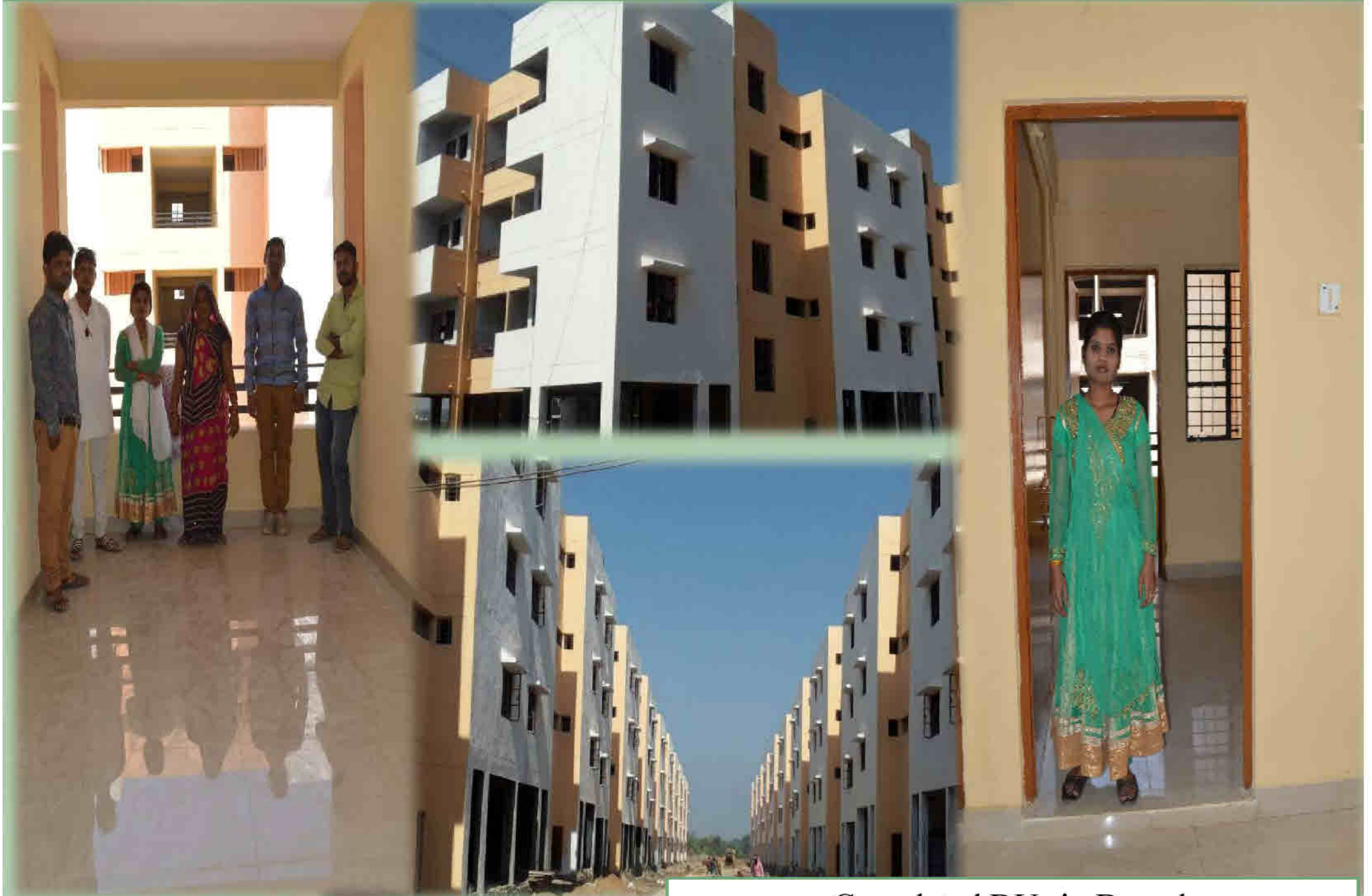
Completed DUs in Damoh