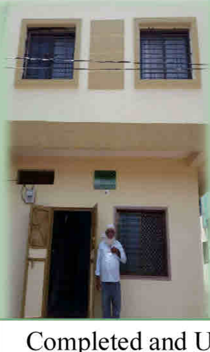
Completed and Under-Construction DUs in Alirajpur