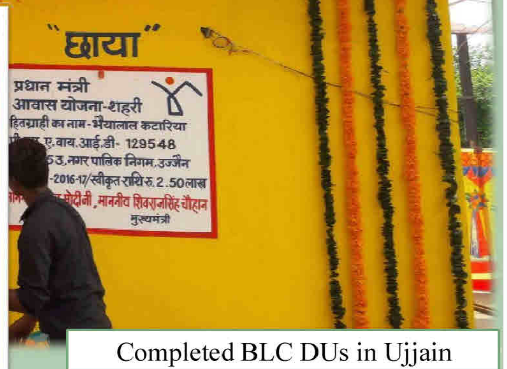
Completed BLC DUs in Ujjain