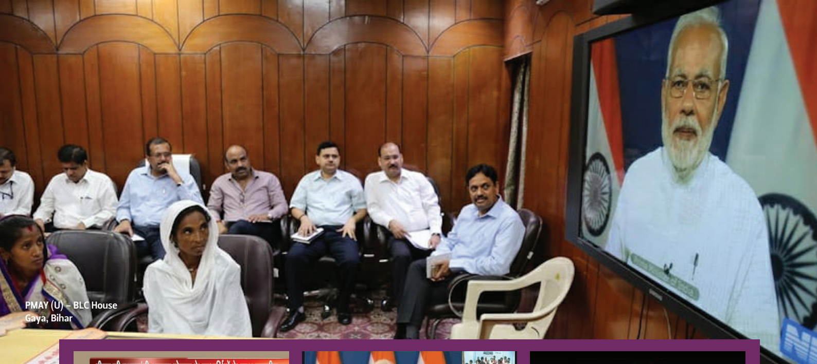
PMAY (U) – BLC House Gaya, Bihar