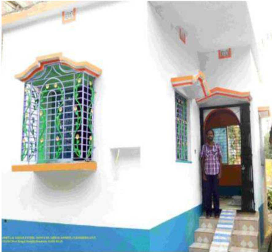
Bansberia Municipality, Hoogly District