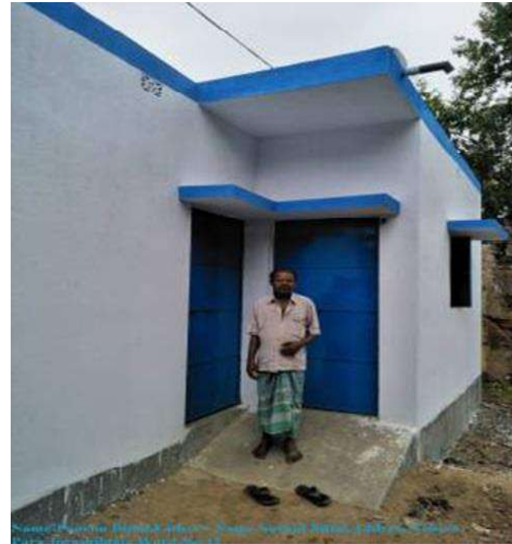
Suri Municipality, Birbhum District