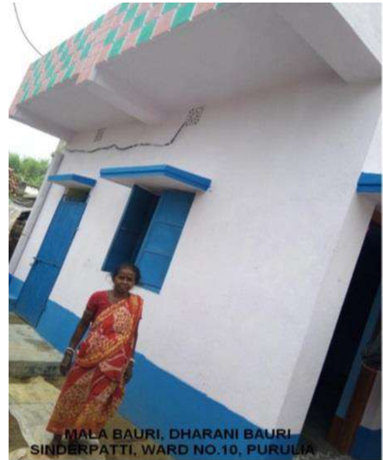
Purulia Municipality, Purulia District